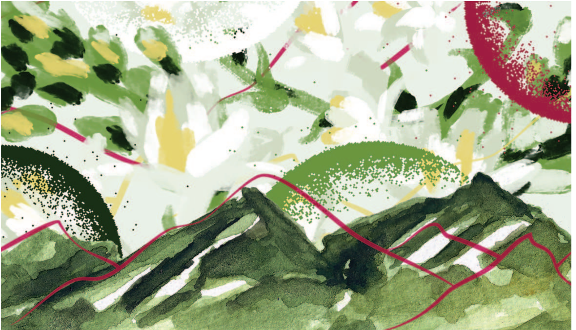
ILLUSTRATION: ABIR HOSSAIN