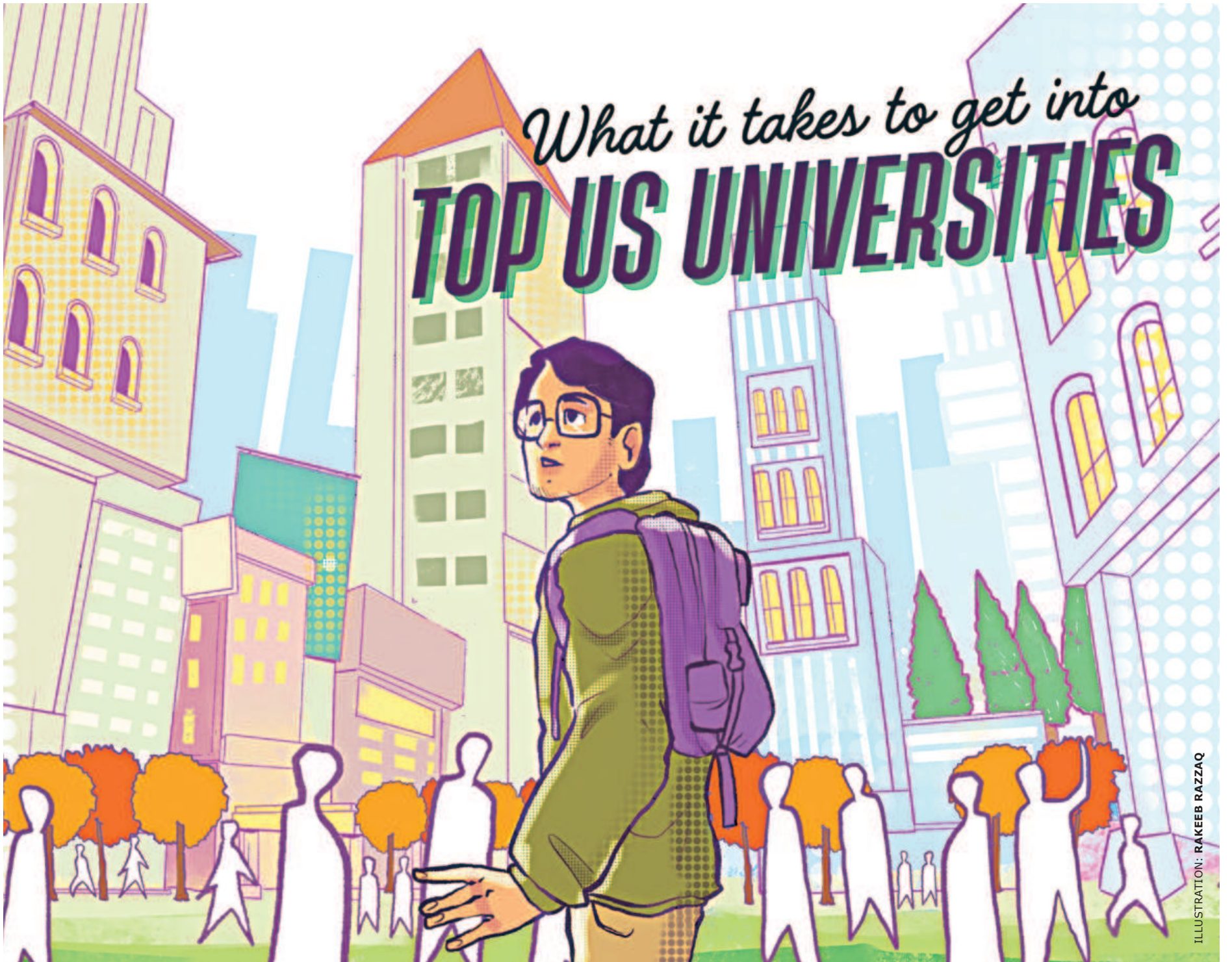
ILLUSTRATION: RAKEEB RAZZAQ