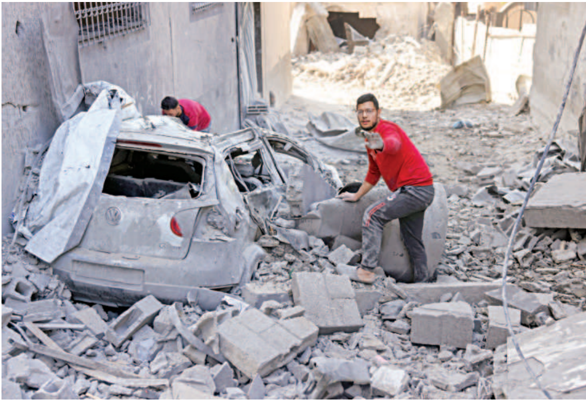
Palestinians inspect the destruction caused by Israeli strikes in Jabalia's Saftawi neighborhood in northern Gaza yesterday.

AFP, Yangon A retired Myanmar general who formerly served as ambassador to Cambodia was shot dead yesterday, two military sources said, in an attack claimed by anti-coup fighters. Myanmar's military seized power in a 2021 coup, sparking a civil war pitching it against pro-democracy guerrillas and resurgent ethnic armed groups that have long been active in the Southeast Asian country's fringes. Most combat is confined to the countryside and smaller settlements, although sporadic grenade and gun attacks on police and junta-affiliated targets are regularly reported in the largest city Yangon. A source close to the military said former general and Cambodia ambassador Cho Tun Aung "was shot and killed" outside his Yangon home around 8:30 am as he gave alms to monks collecting donations. "He used to donate meals every morning," the source said, speaking on condition of anonymity. "The shooters used this opportunity to assassinate him." A military officer confirmed Cho Tun Aung had been shot and killed without providing further details.