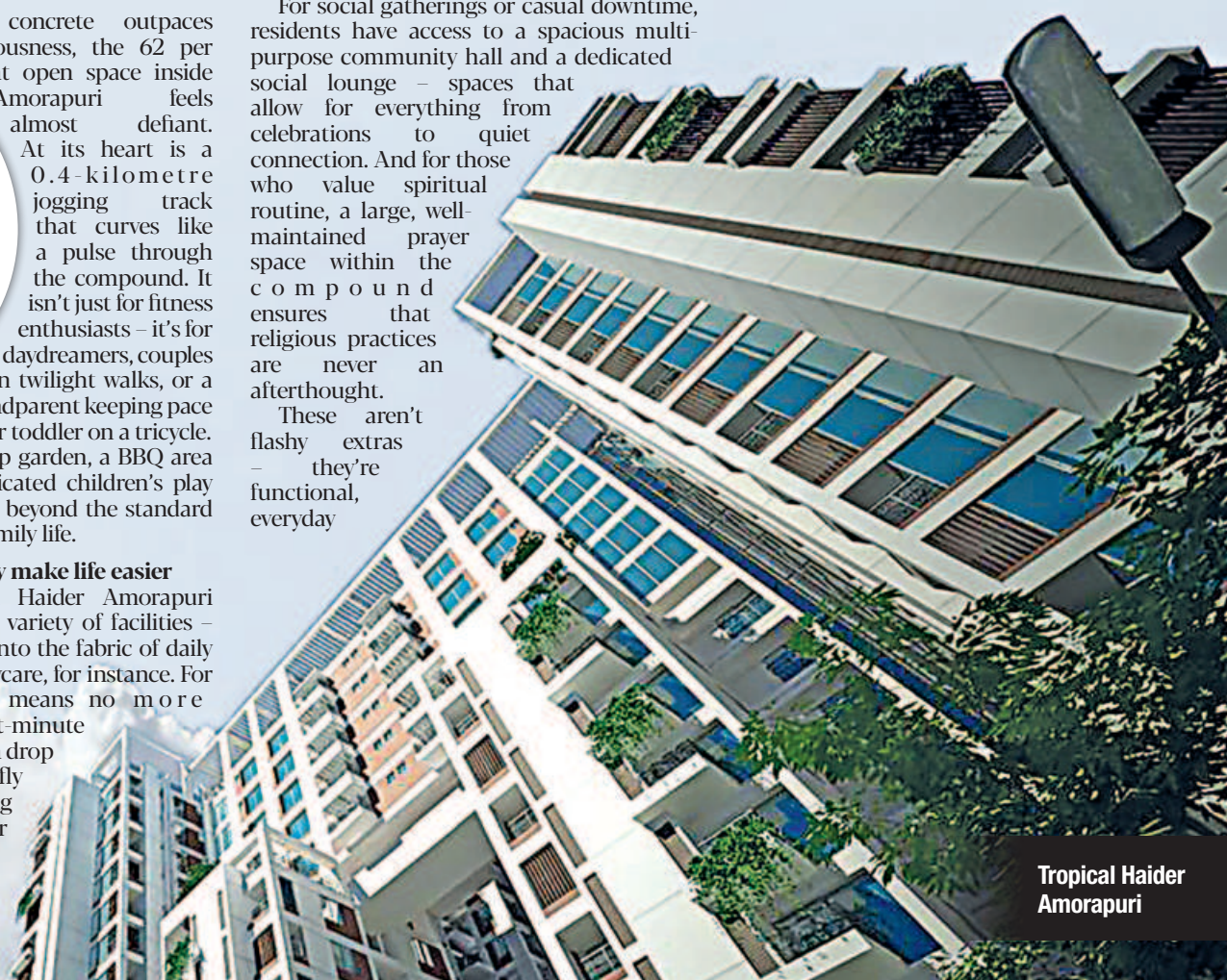
Tropical Haider Amorapuri