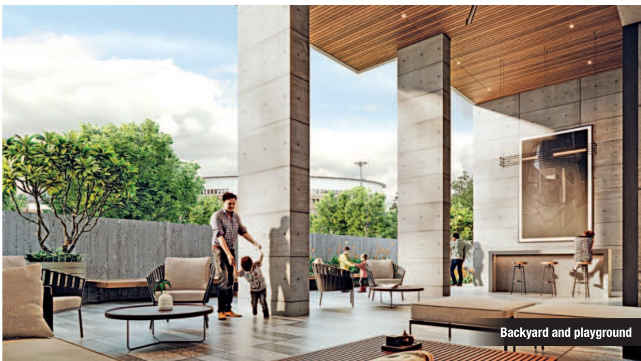
Backyard and playground

sky garden, well-ventilated interiors, and communal green spaces intended to encourage a more active, community-focused lifestyle.