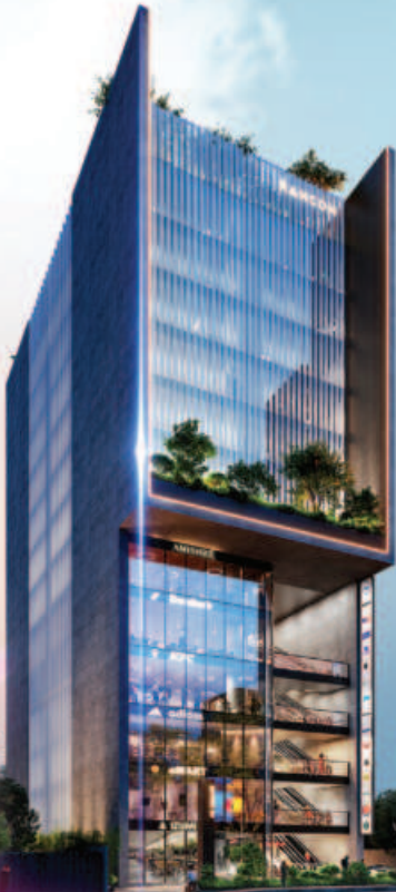
AK SQUARE ROAD 02, DHANMONDI