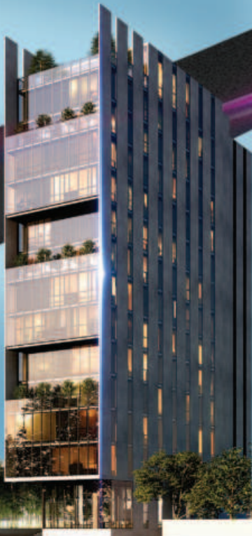
VANTAGE 27 ROAD 27, DHANMONDI

EXPLORE LEADING BUSINESS OPPORTUNITIES IN DHANMONDI