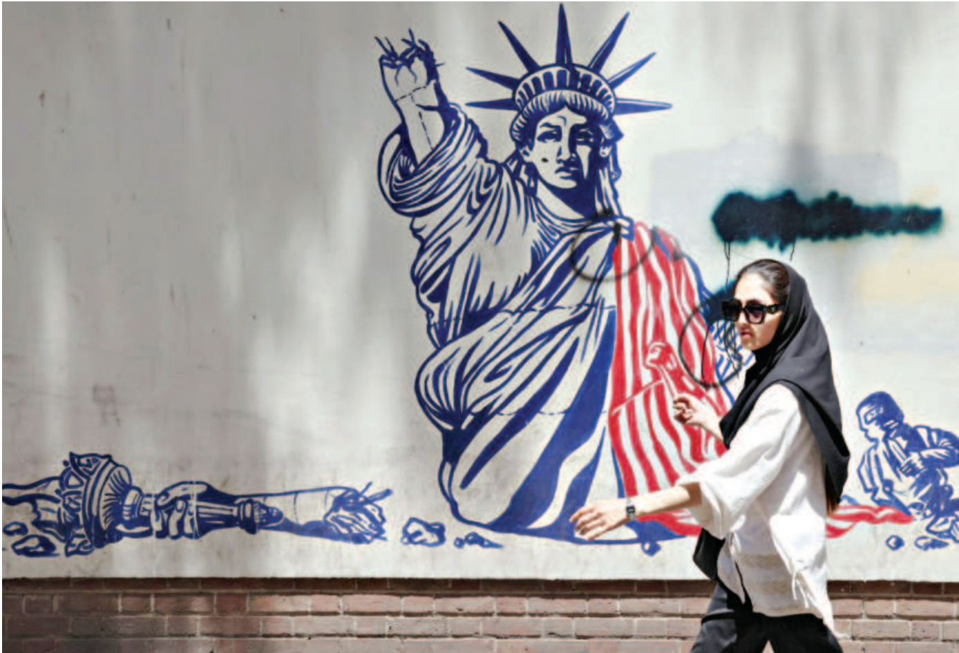
A woman walks past an anti-US mural near the former US embassy in Tehran yesterday. Iran's supreme leader Ayatollah Ali Khamenei yesterday said that nuclear talks with the United States were unlikely to yield any results.