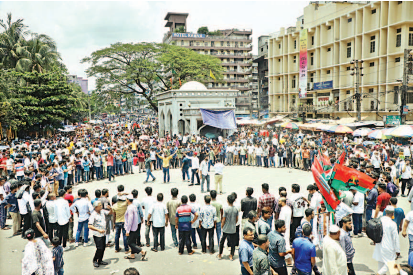
Supporters of BNP leader Ishraque Hossain block the Golapshah Mazar road at Gulistan for over five hours from 10:00am yesterday as they continued their demonstration for the sixth consecutive day demanding Ishraque be sworn in as the mayor of Dhaka South City Corporation.