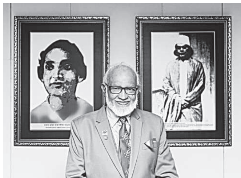
Mustafa Zaman Abbasi (1937-2025)

scholar Sahl al-Tustari, and yet, he was never insular. He sang devotional pieces like "Madeenar dhuli aji dhannya", penned spiritual works such as "Rumir Oloukik Bagan" and "Muhammad er naam (The Name of Muhammad)", yet he was equally at ease writing contemporary literature like "Harinakhi" and "Shondhye Hoyni Ekhono". Abbasi's understanding of Islam was gentle. He believed, and often said, that Muslims should also love believers of other faiths.