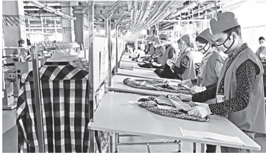
Bangladesh's RMG sector needs to come out of the low-cost, low-tech, and labour-intensive business models.

People generally do not like "change" and prefer to maintain the "status quo," which leads to organisational inertia. Crisis and a chaotic environment bring opportunities to think freshly, introduce harsh reform, and rebuild organisations. The current global trade frictions can help create many opportunities for Bangladesh's manufacturing industry if proper reforms, investment in infrastructure and technology, and institutional policies are updated, and effectiveness is improved.