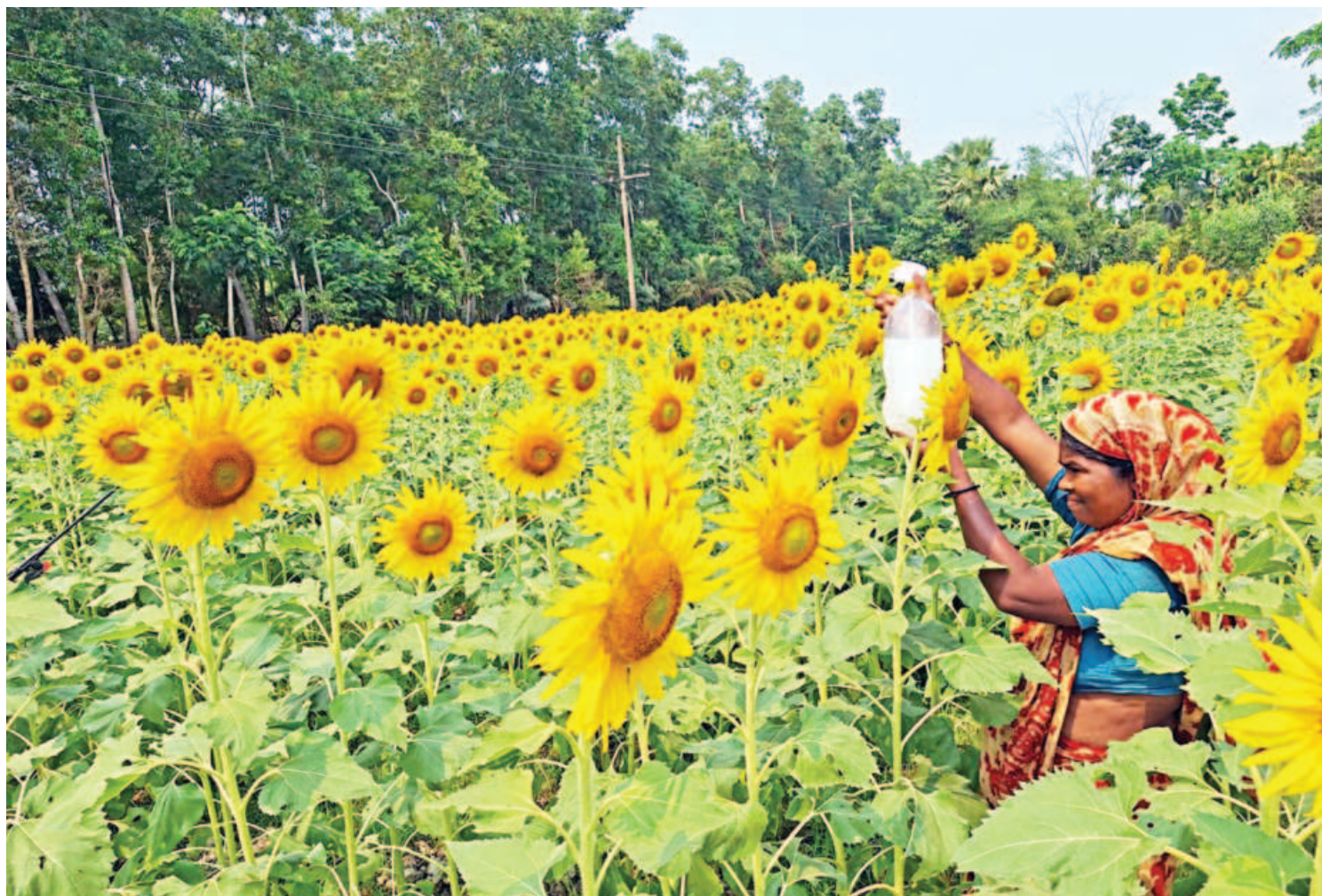
In the face of rising edible oil prices, oilseed cultivation has become more popular among farmers in the southern regions of the country. Sunflowers are the preferred choice in Barguna, with yields reaching at least 2 tonnes per hectare and each kilogramme of seeds producing up to 400 grammes of oil.

The interim government issued the ordinance on May 12, prompting protests.