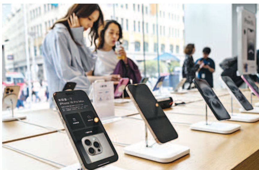
People browse for iPhones at an Apple store in the Huangpu district in Shanghai on April 11, 2025.

The effective US tariff rate on imports from China currently stands at 31.8 percent, per a report from ratings agency Fitch on May 13, the highest of any trading partner.