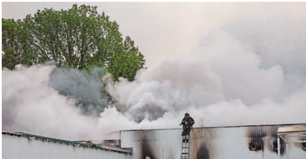
A firefighter works at the site of a private enterprise hit by a Russian drone strike, amid Russia's attack on Ukraine, outside of Kyiv yesterday.

Well-wishers in the crowd waved US and Peruvian flags, with people from both countries claiming him as the first pope from their nations.