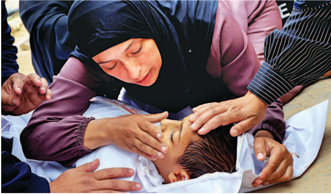
Family members say goodbye to their beloved boy at Nasser hospital in Khan Younis of Gaza yesterday. The boy is among hundreds of Palestinians who have been killed in Israeli strikes over the last couple of days. Yesterday alone, 130 people were killed. Story on page 12