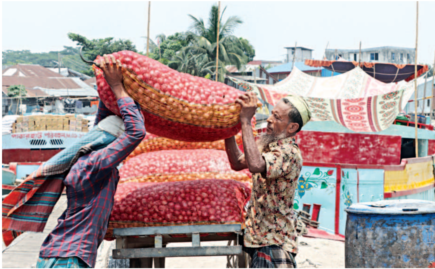
Amid the scorching summer heat, labourers unload sacks of onions brought on handcarts from local warehouses to be shipped to different parts of the country via trawlers. Exhausted from the hard work, they toil from 6 in the morning until night, earning between Tk 1,000 and Tk 1,500 per day. The photo was taken on Sunday from the Balurghat area of Barishal city.

The consolidated net operating cash flow per share surged to Tk 12.18 for January-March 2025, from Tk 2.14 (restated) in the corresponding period a year ago.