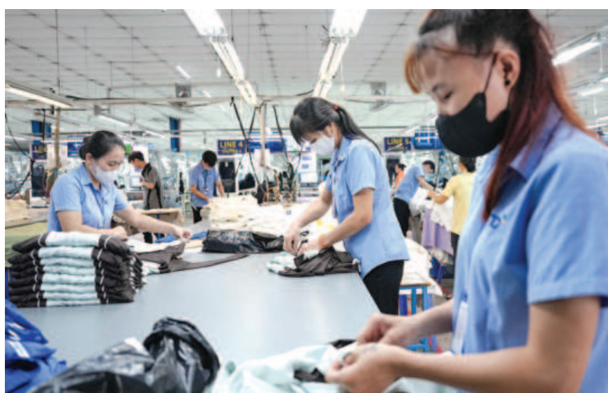
Vietnamese garment factory workers folding apparel at a factory in Ho Chi Minh City on April 3. For countries like Vietnam, the unexpected US rapprochement with Beijing ratchets up pressure to reach their own sweeter deals.

Vietnam, Thailand and Malaysia are currently negotiating their own tariff deals with the United States. Mexico, which avoided reciprocal tariffs, is also seeking to reduce separate import duties on specific products such as automobiles.