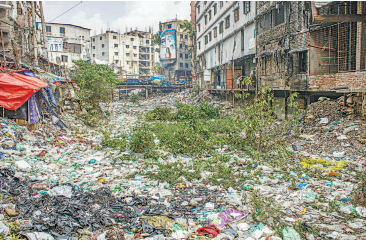
Once a vital water source for Keraniganj residents, the Shubhadya Canal has now turned into a dumping ground, choked by market and garment waste. Yesterday, Environment Adviser Syeda Rizwana Hasan announced that the canal will be re-excavated to revive the long-neglected waterbody. The photo was taken recently.

According to the complaint, the power sector witnessed expenditures amounting to $28.3 billion (nearly Tk 4 lakh crore) over the past 15 years. Of this, an estimated Tk 1 lakh crore (one-fourth) is alleged to have been misappropriated under the guise of "capacity charges."