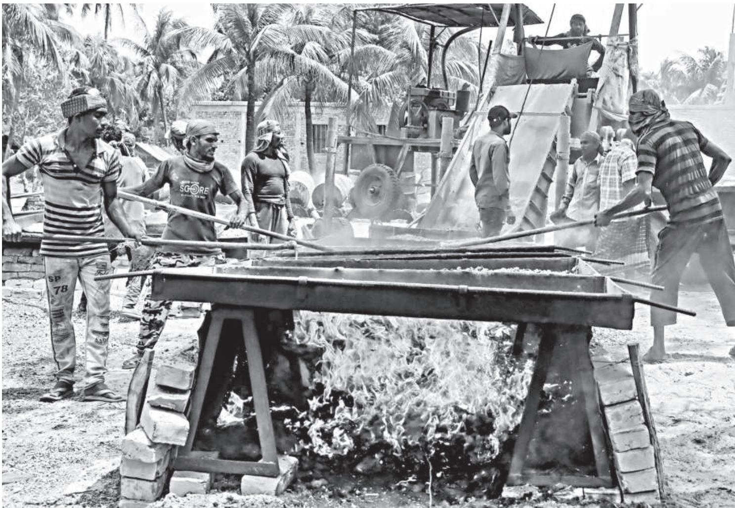
Workers prepare bitumen for roadwork in Khulna. After an entire day of intense labour amid soaring temperatures, they earn around Tk 700. The photo was taken in the Rajbadh area of Batiaghata recently.

The two arrestees yesterday were produced before a Panchagarh court that sent them to jail, said the OC.