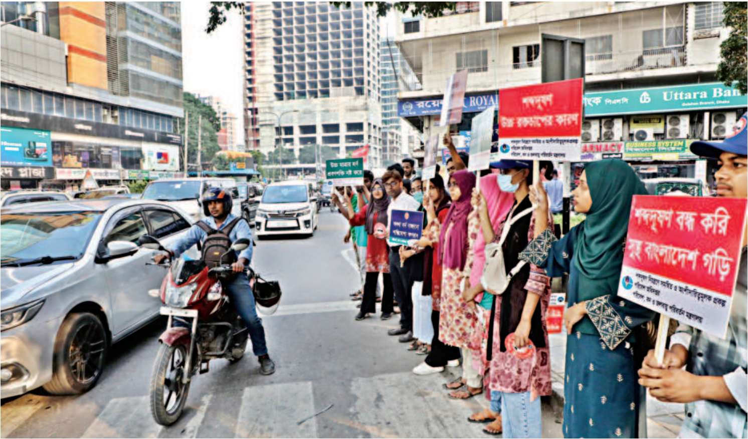
Volunteers hold up signs saying “Honking not allowed” and “Please don’t honk” while vehicles wait at the Gulshan-2 intersection. Under a new initiative from the environment ministry, volunteers from several green organisations are raising awareness at traffic signals in various area of the capital. The aim is to reduce noise pollution by informing drivers that unnecessary use of horns is not allowed. The photo was taken yesterday.