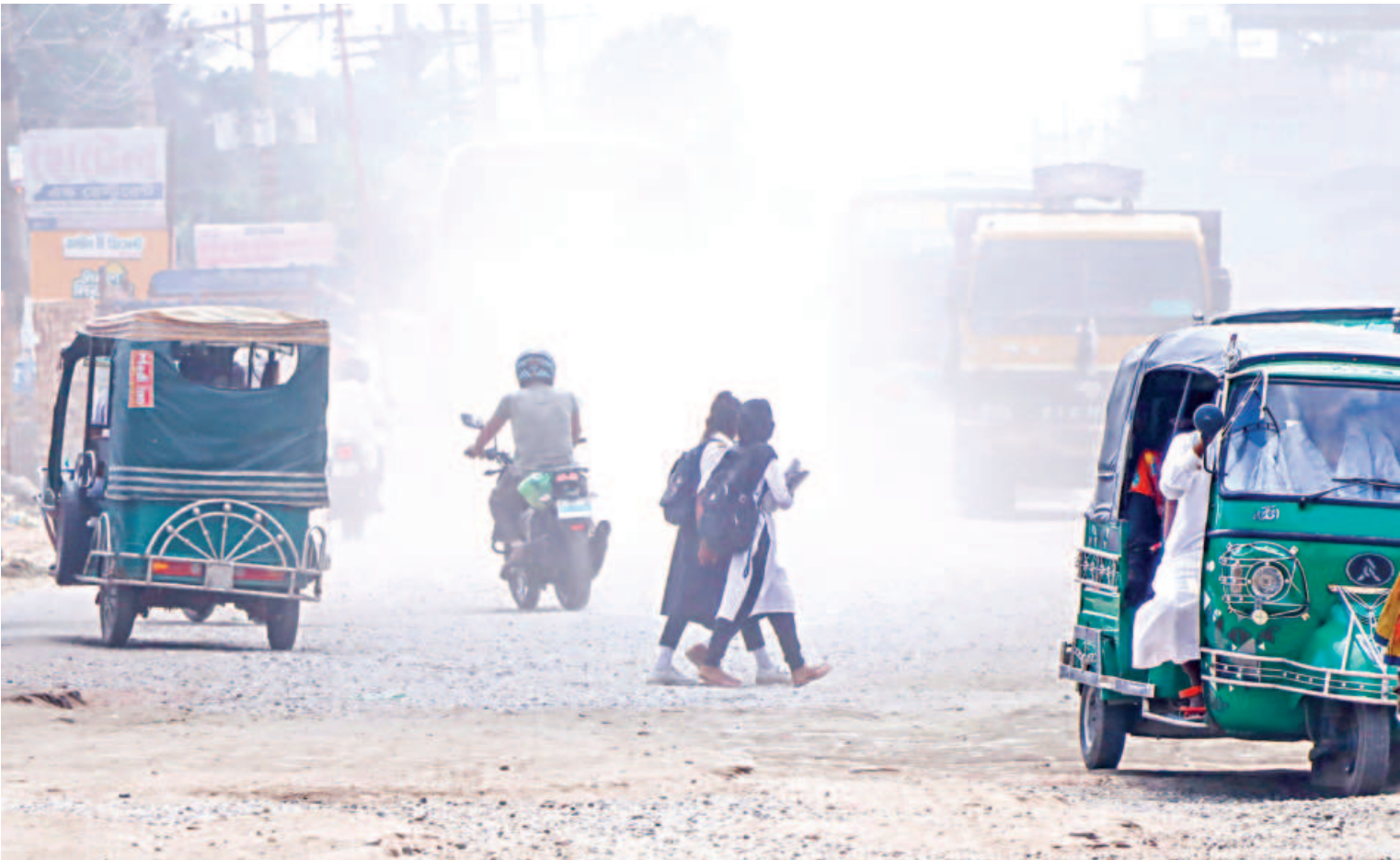
The Khulna-Satkhirah highway has been in a dismal condition for a long time. Due to constant movement of vehicles, the road remains shrouded in dust, tormenting pedestrians, residents, and local businesses. The photo was taken in the Zero Point area of Khulna city.