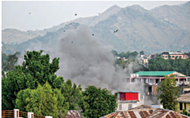
Smoke billows after an artillery shell from Pakistan landed in the main town of Poonch district in India's Jammu region yesterday.