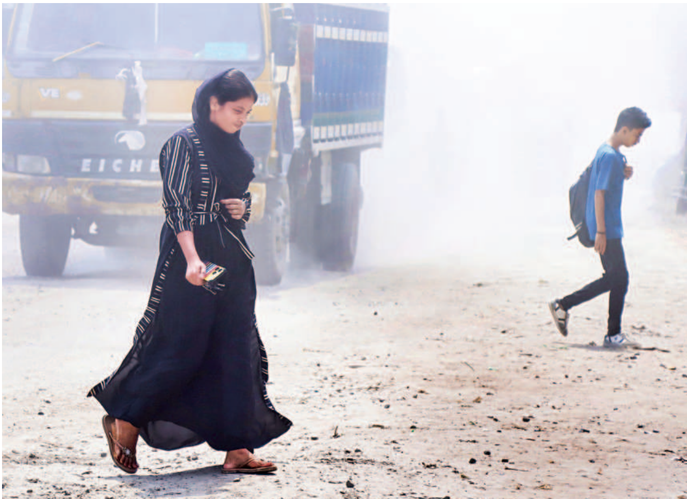
The Khulna-Satkhira highway has been in a dismal condition for a long time. Due to constant movement of vehicles, the road remains shrouded in dust, tormenting pedestrians, residents, and local businesses. The photo was taken in the Zero Point area of Khulna city.