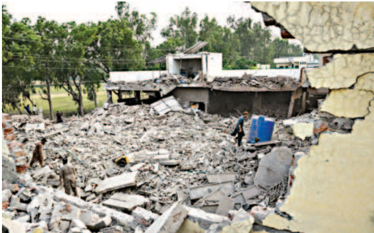
Locals inspect debris of destroyed structures of the Government Health and Educational complex in Muridke, about 30km from Lahore.