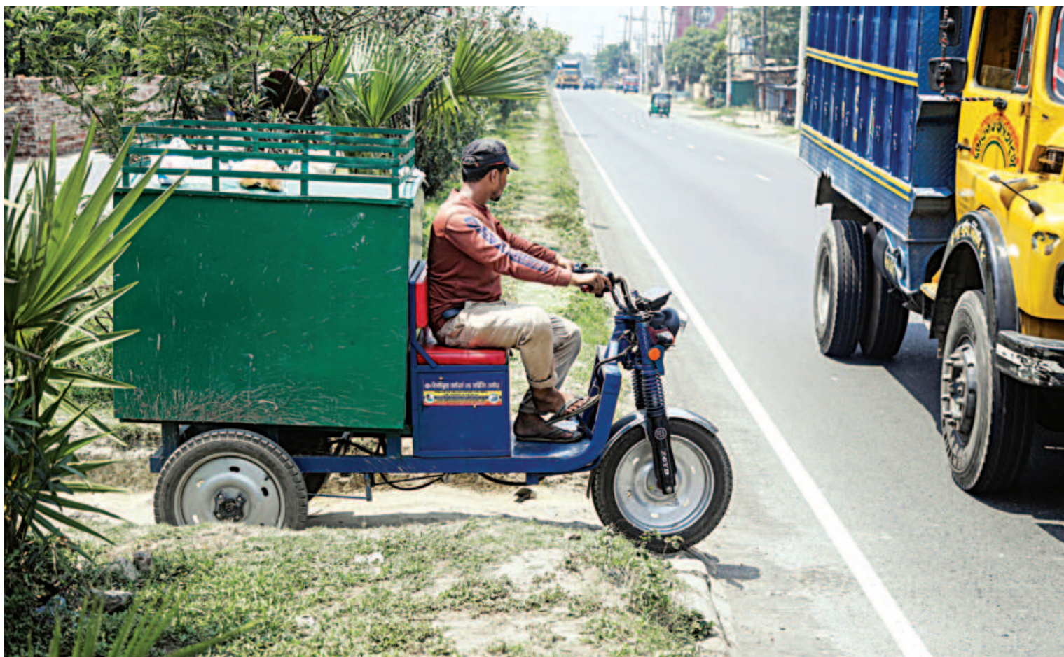
Several unauthorised U-turns have been created on the Dhaka-Chattogram highway by cutting through the road dividers. Risking a collision, a three-wheeler, which is not allowed to ply the highway, uses one such U-turn at Kumira area in Sitakunda upazila yesterday.