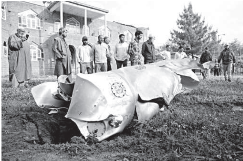
Metal debris lies on the ground in Wuyan in India-administered Kashmir's Pulwama district, May 7, 2025.

Retaliating to the Indian strikes, Pakistan has already launched heavy artillery shelling along the de facto border between the two nations, reports BBC. India has claimed the