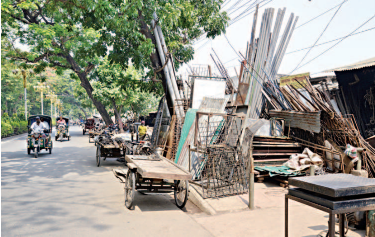
The footpath from Rajshahi Rail Gate to Bhadra has been entirely occupied. It is now taken over by various types of vendors who are running their businesses there. As a result, pedestrians are forced to walk on the road. The photo was taken yesterday.