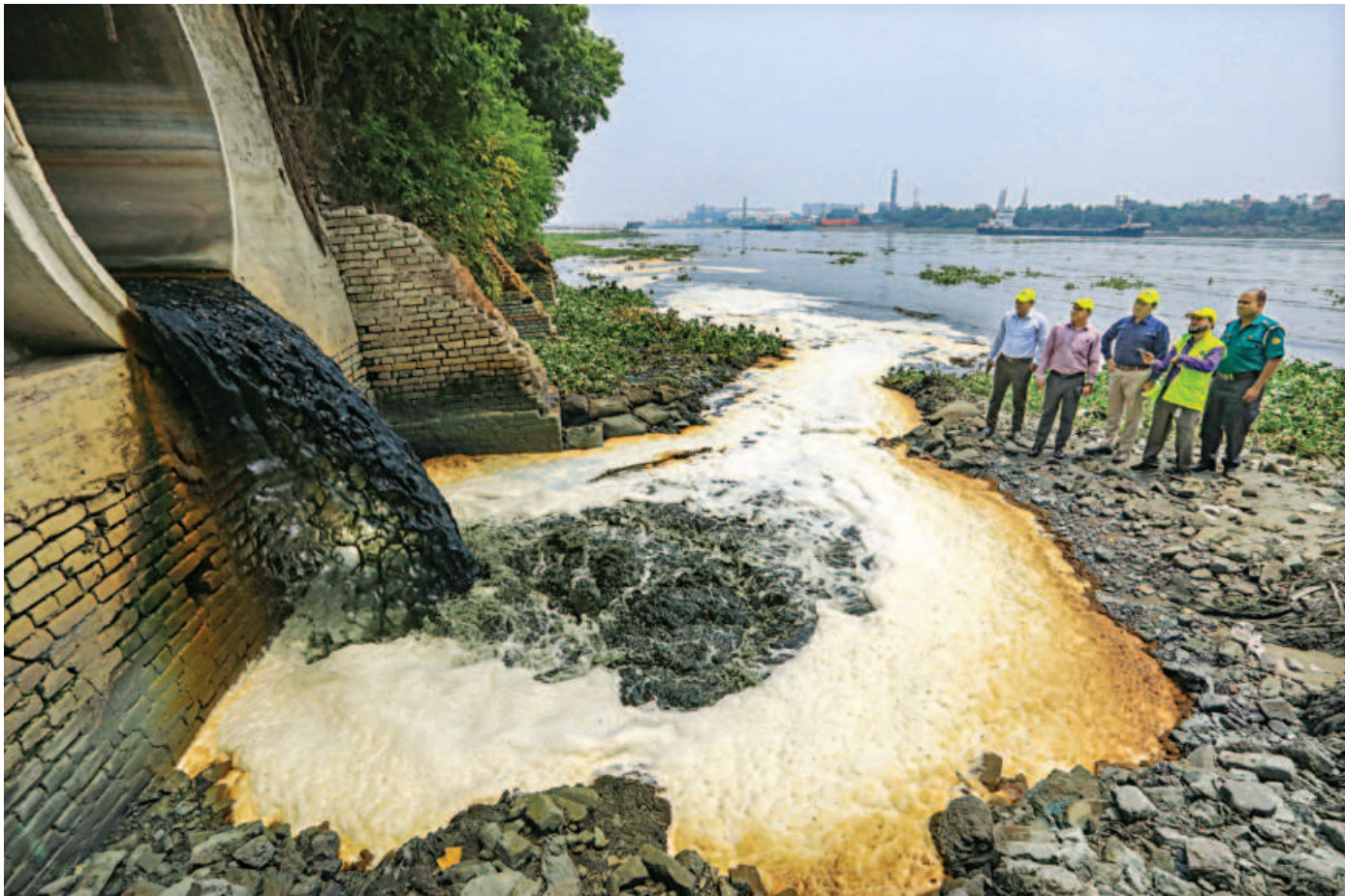
A team from the Department of Environment inspects a site where untreated industrial waste is being discharged into the Buriganga river. They later took a water sample from the site. The photo was taken yesterday at Doleshwar Ghat in Dhaka's Shyampur.