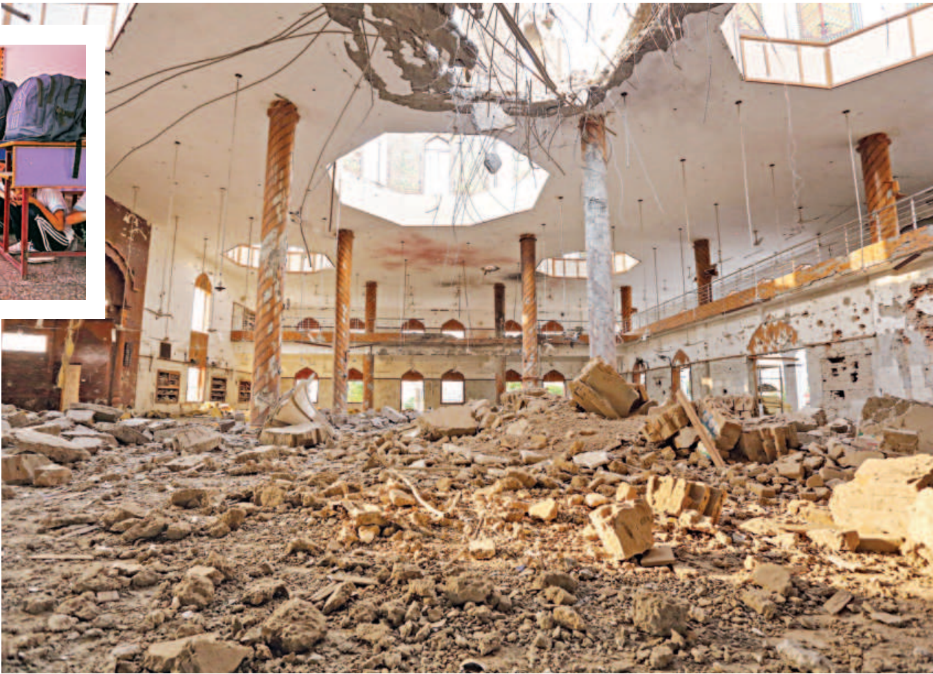
A broad view of a damaged Islamic seminary following Indian strikes in Ahmedpur Sharqia, approximately 7 kilometres from Bahawalpur in Pakistan's Punjab province, yesterday. Inset , students participate in an emergency mock drill as part of the nationwide civil defence exercise at a school in New Delhi, amid rising border tensions.

The HAMMER, short for Highly Agile Modular Munition Extended Range, smart bomb was used to strike hardened infrastructure such as multi-storey buildings used as logistical centres by LeT and JeM.