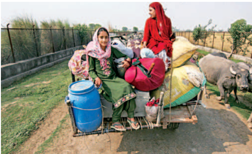
Villagers carry their belongings as they move to safer areas after authorities ordered evacuation near the border at Jeora Farm on the outskirts of Jammu in Indian-occupied Kashmir yesterday.

India said it hit militant groups Jaish-e-Mohammed and Lashkar-e-Taiba. Jaish later said 10 relatives of its leader Masood Azhar -- who was released from an Indian jail in 1999 in exchange for 155 hostages from a hijacked Indian Airlines plane -- were killed, with no mention of the fate of Azhar himself.