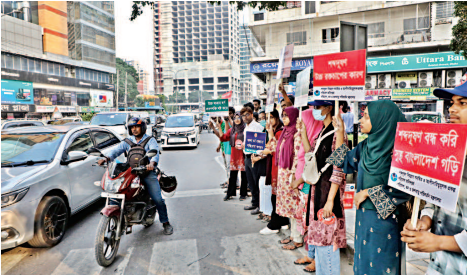
Volunteers hold up signs saying "Honking not allowed" and "Please don't honk" while vehicles wait at the Gulshan-2 intersection. Under a new initiative from the environment ministry, volunteers from several green organisations are raising awareness at traffic signals in various area of the capital. The aim is to reduce noise pollution by informing drivers that unnecessary use of horns is not allowed. The photo was taken yesterday.