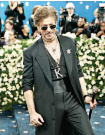
Shah Rukh Khan