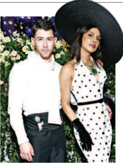
Nick & Priyanka Chopra Jonas