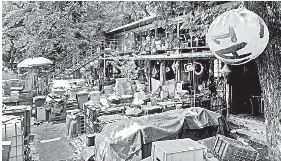
Rows of shops line both sides of the highway in the Madam Bibir Hat area of Sitakunda, Chattogram, selling furniture, electronic items, ladders, ropes, and various other goods collected from old ships. Buyers from different parts of the country come here to purchase what they need.