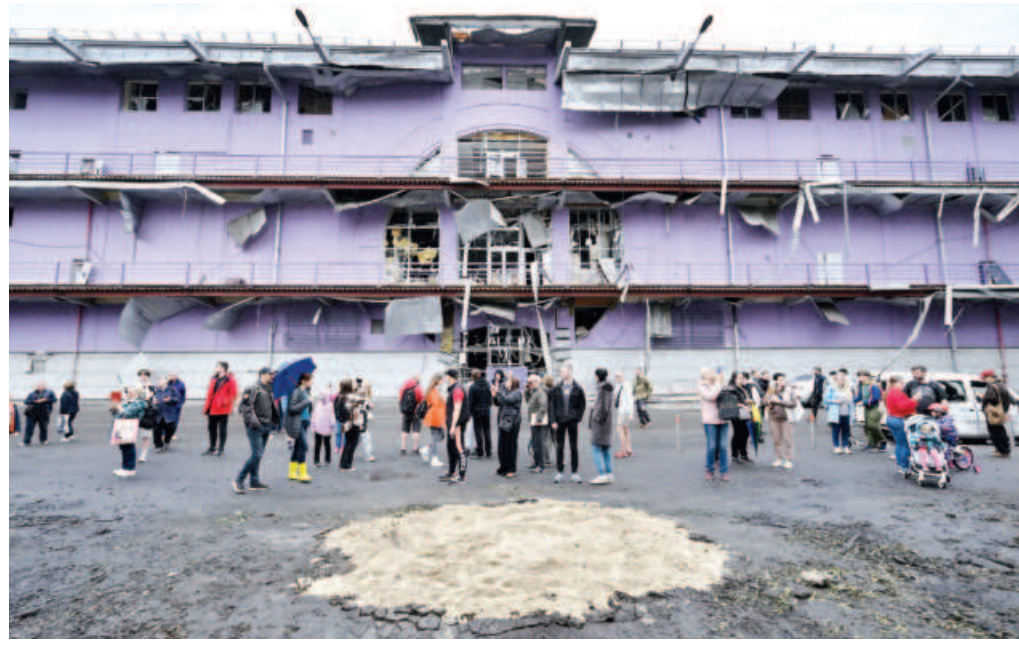
People gather to inspect the damage to a shopping mall, standing near a crater filled with fresh sand, following a night-time Russian drone attack on Kyiv, Ukraine, yesterday. A Russian overnight drone attack on Kyiv injured at least 11 people, including two children.