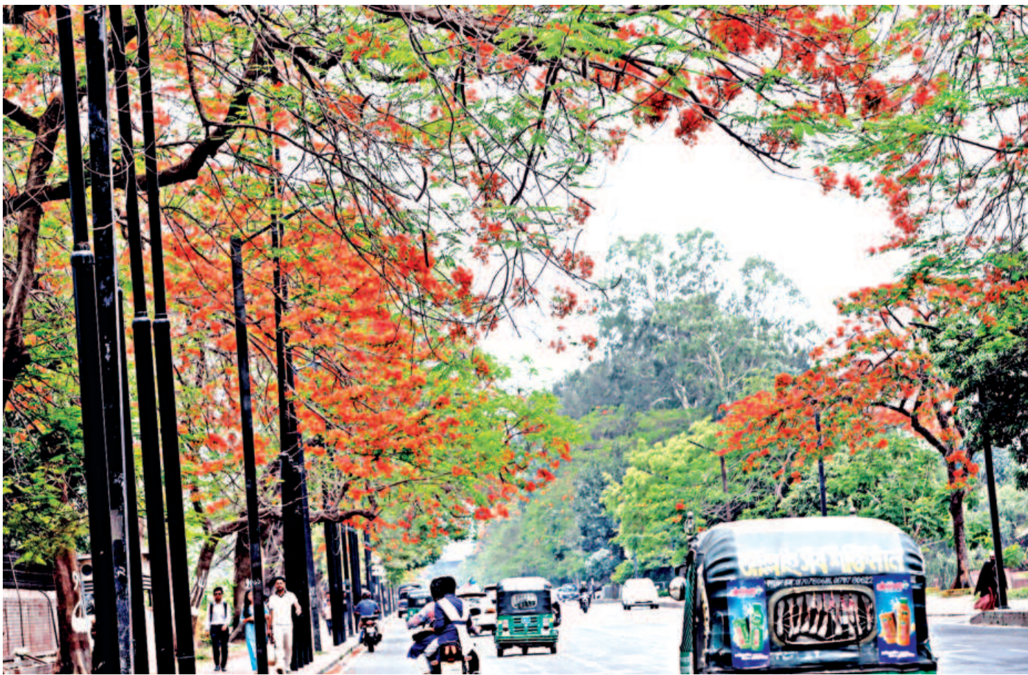
The Krishnachura trees, crowned with blazing orange blooms, turn the everyday street into a canvas of fire and beauty. The photo was taken yesterday near Chandrima Udyan.