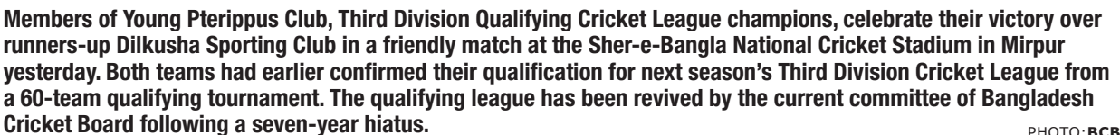
Cricket Board following a seven-year hiatus.

"We want to climb the world ranking. But if you ask more specifics, for me it would be very good if we move into the quarterfinals. Quarterfinals is a good position under top 10 and it opens door for the podium," the German coach added.