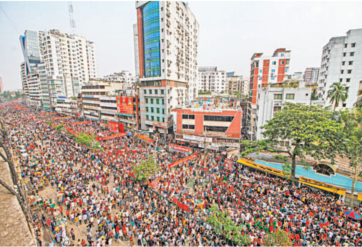
People gather in front of the BNP's central office in Nayapaltan to take part in the party's Labour Day rally on Thursday. Key BNP policymakers addressed the event where thousands joined from factories in Dhaka, Narayanganj, Gazipur, Narsingdi, Tangail, Manikganj, and Munshiganj.