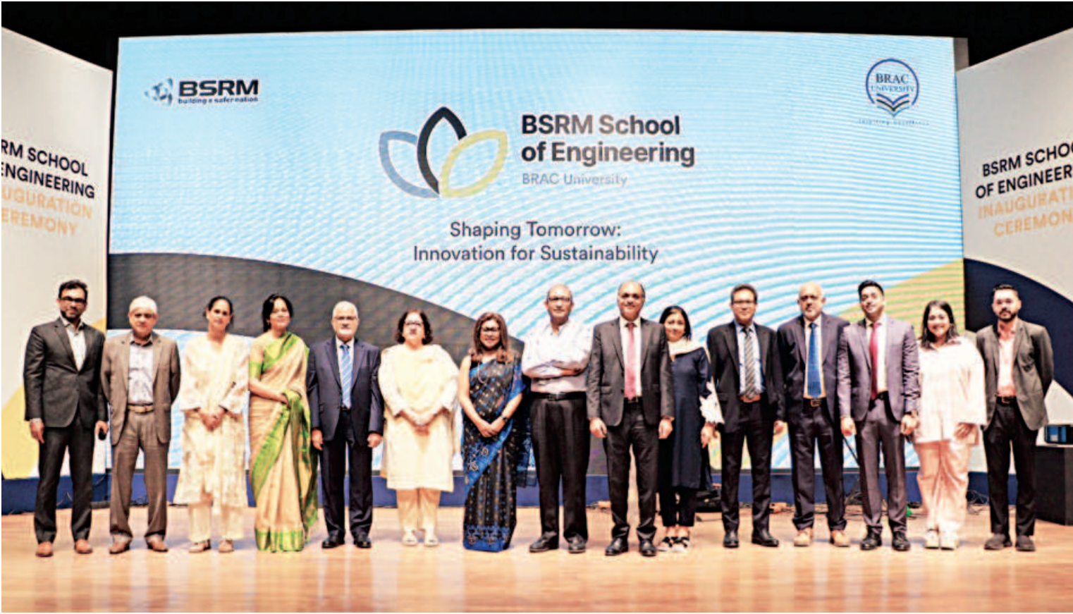
Guests at the inaugural ceremony of the BSRM School of Engineering at BRAC University's Merul Badda campus on April 30.