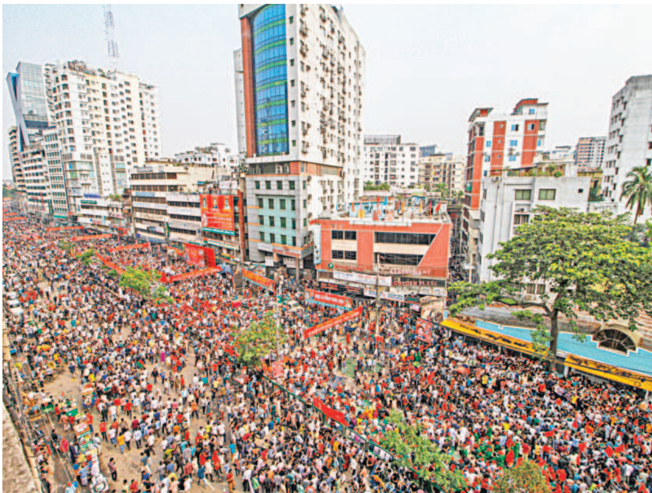
People gather in front of the BNP’s central office in Nayapaltan to take part in the party’s Labour Day rally on Thursday. Key BNP policymakers addressed the event where thousands joined from factories in Dhaka, Narayanganj, Gazipur, Narsingdi, Tangail, Manikganj, and Munshiganj.