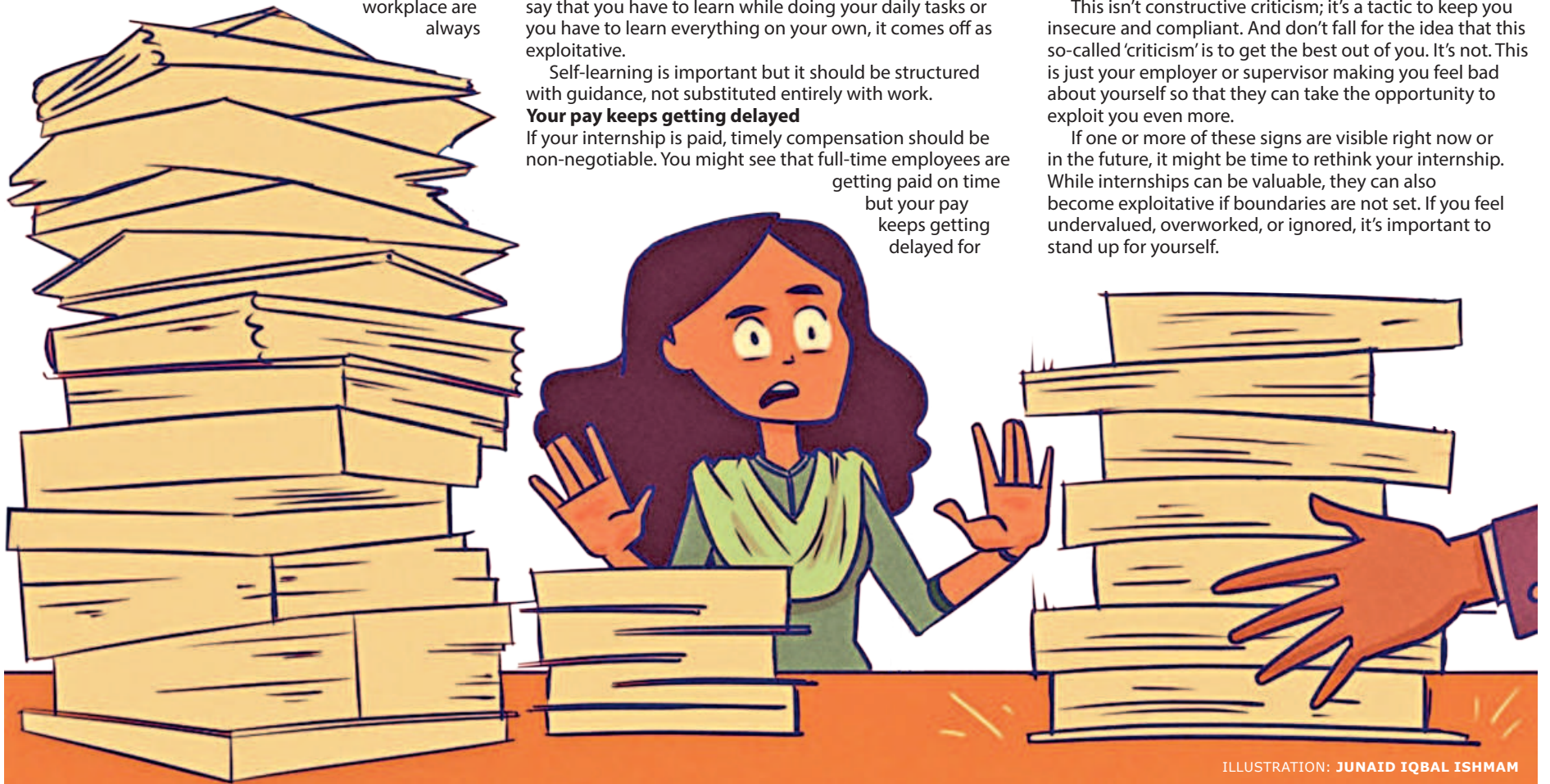
ILLUSTRATION: JUNAID IQBAL ISHMAM

If one or more of these signs are visible right now or in the future, it might be time to rethink your internship. While internships can be valuable, they can also become exploitative if boundaries are not set. If you feel undervalued, overworked, or ignored, it's important to stand up for yourself.