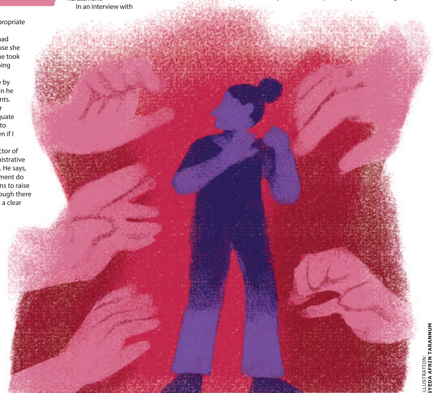
ILLUSTRATION: SYEDA AFRIN TARANNUM

That is not to say that institutional policies are not needed. They are required to tackle the pressing issue that has been borne out of the gross negligence displayed towards the safety of women and gender-diverse individuals. Moreover, the most fundamental function of these institutions is to educate and enlighten young minds. They wield significant influence not only on the discourse surrounding issues of sexual violence but also in terms of informing people, raising awareness, and to various extents breaking the stigma that prevails. The culture of domination is pervasive. And as institutions that continue to function with it in the backdrop, they bear some responsibility in dismantling it.