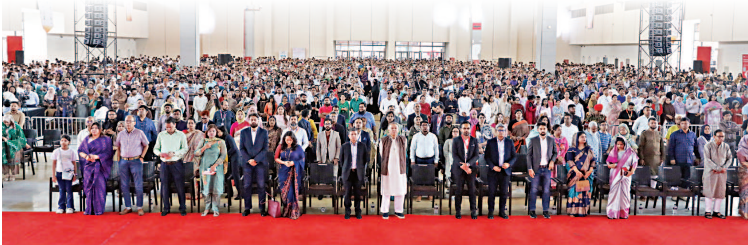
Distinguished guests and students observe a minute of silence in honour of the victims of the July uprising at the 24th The Daily Star HSBC O & A Level Awards at Bangladesh-China Friendship Exhibition Center yesterday.