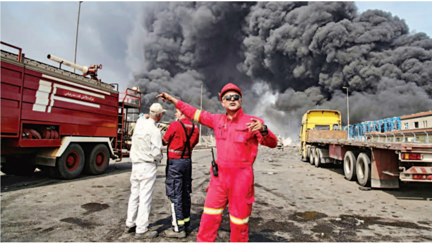
Thick, black smoke rises as rescuers arrive near the source of an explosion at the Shahid Rajaei port dock southwest of Bandar Abbas in the Iranian province of Hormozgan yesterday. Several containers exploded on April 26 at Iran’s largest commercial port, authorities said, causing a major blast and fire, and leaving hundreds injured.

state TV reported that at least 516 people were injured and “hundreds have been transferred to nearby medical centres”. It is located 23 kilometres west of Bandar Abbas, the Hormozgan provincial capital, and north of the Strait of Hormuz, through which a fifth of world’s oil output passes. The explosion was so powerful that it could be felt and heard about 50 kilometres away, Fars news agency reported, with residents saying they could feel the ground shake even at a distance. “The shockwave was so strong that most of the port buildings were severely damaged,” Tasnim news agency reported.