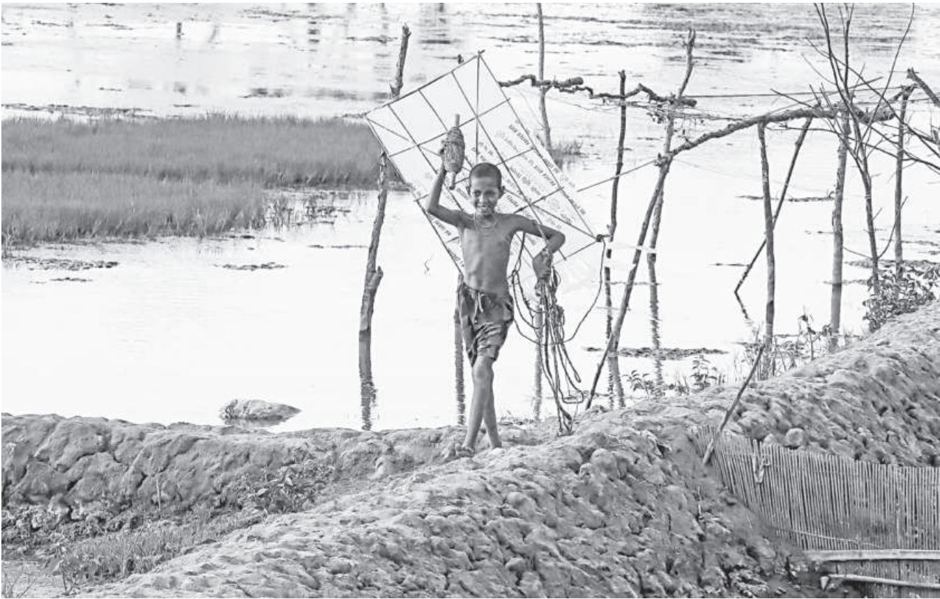
A child heads to the field with his kite, his face glowing with joy. In the southern winds of Baishakh afternoons, children fill the sky with kites. The photo was taken in Kadamtala village of Shyamnagar upazila, Satkhira yesterday.

After the arrest, police initiated an investigation into the matter, said the OC, adding that the arrestees would be produced before the court today.