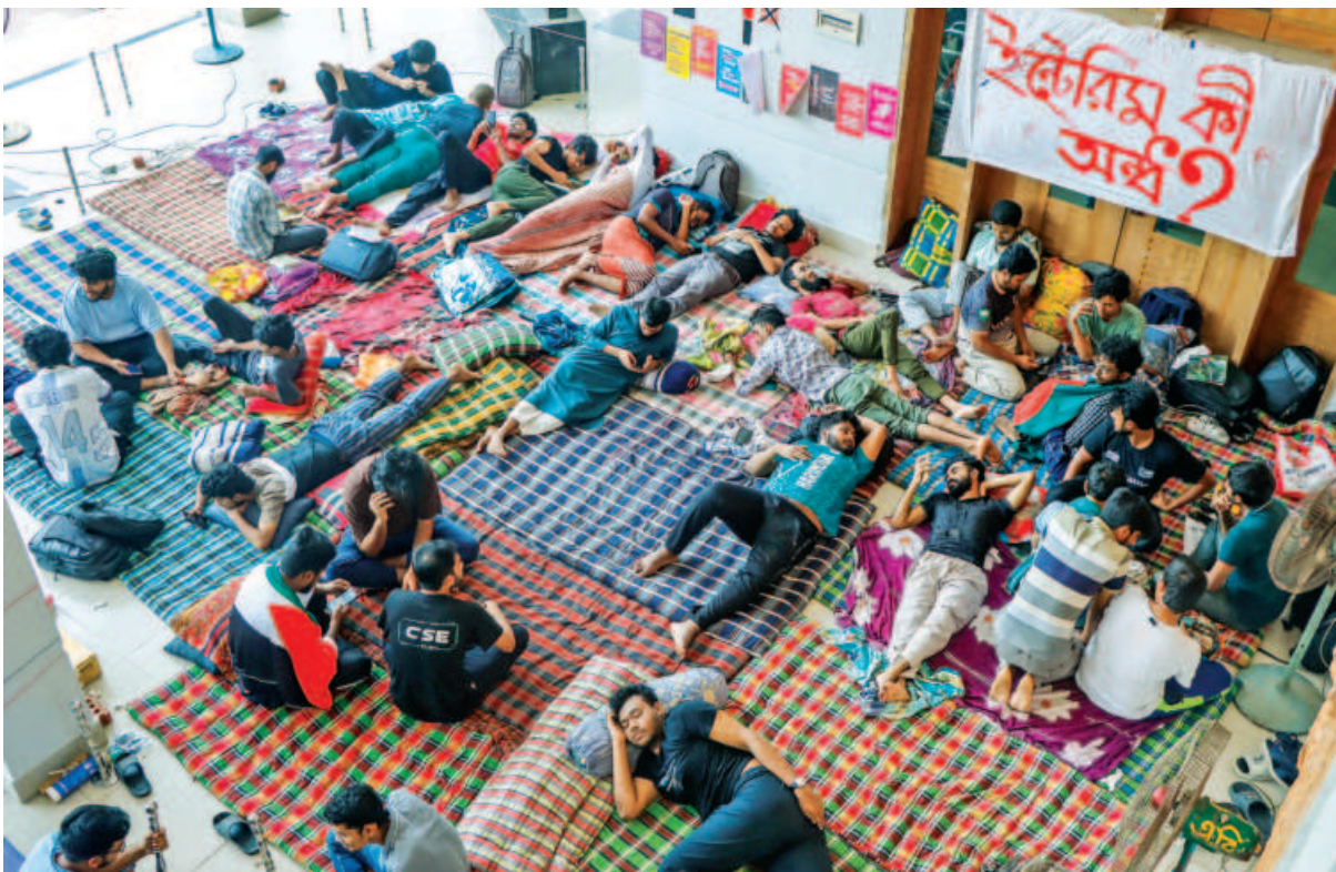
Around 32 Kuet students observed a hunger strike for the second consecutive day yesterday, demanding the resignation of the university vice-chancellor. The strike has left many of them physically weakened. The photo was taken in front of the university's Student Welfare Centre.