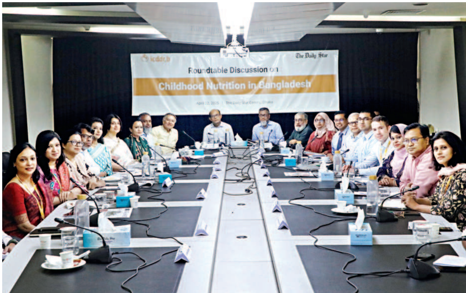
Speakers at a roundtable on “Childhood Nutrition in Bangladesh”, jointly organised by The Daily Star and icddr,b at the capital's The Daily Star Centre yesterday.