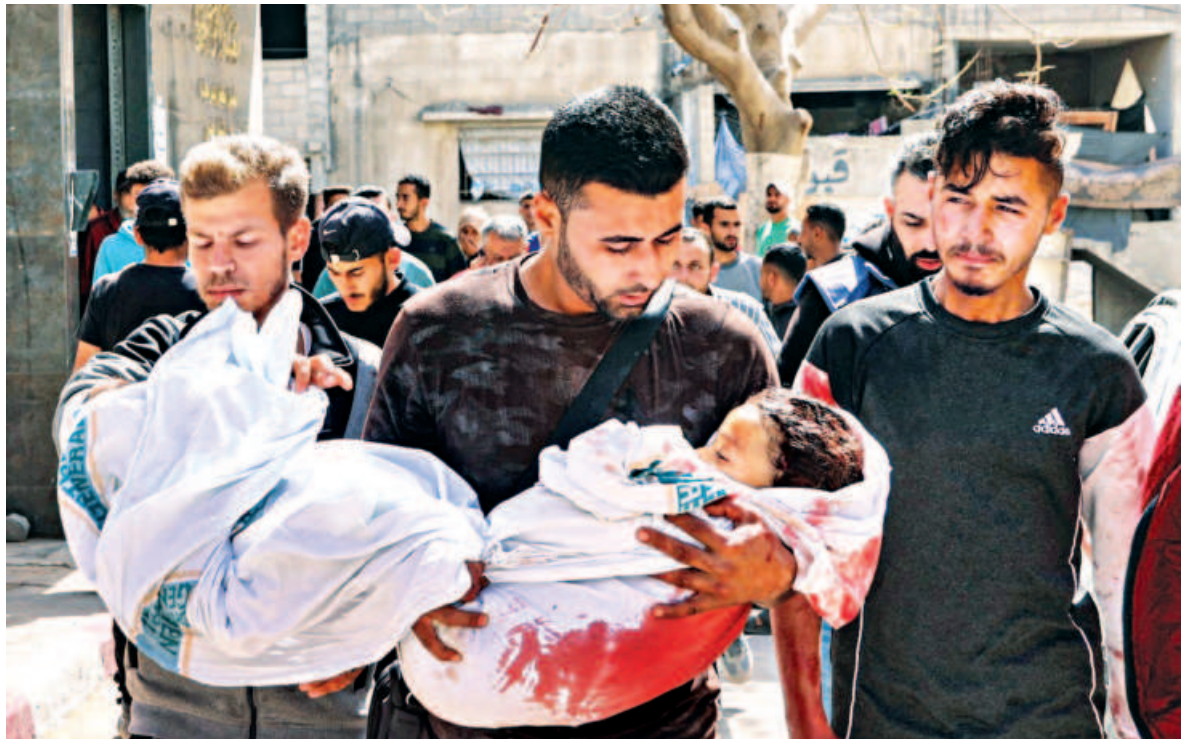
Brothers take the body of a four-year-old child for funeral. The child was killed in an Israeli strike at a site of a tent camp for displaced Palestinians in Gaza City yesterday.