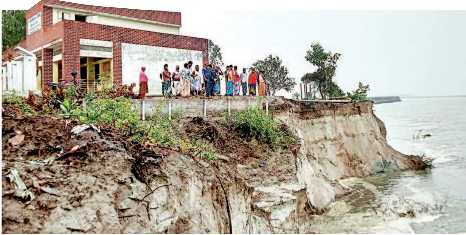
Residents stand close to the crumbling riverbank next to the Char Dakatia Government Primary School in Dewanganj upazila of Jamalpur. Severe and unexpected erosion has devastated three upazilas in the district -- Dewanganj, Islampur, and Madarganj -- with hundreds of homes and vast farmland swallowed by the Jamuna. With the erosion situation getting worse, the school now also faces the threat of being devoured by the river. The photo was taken yesterday.