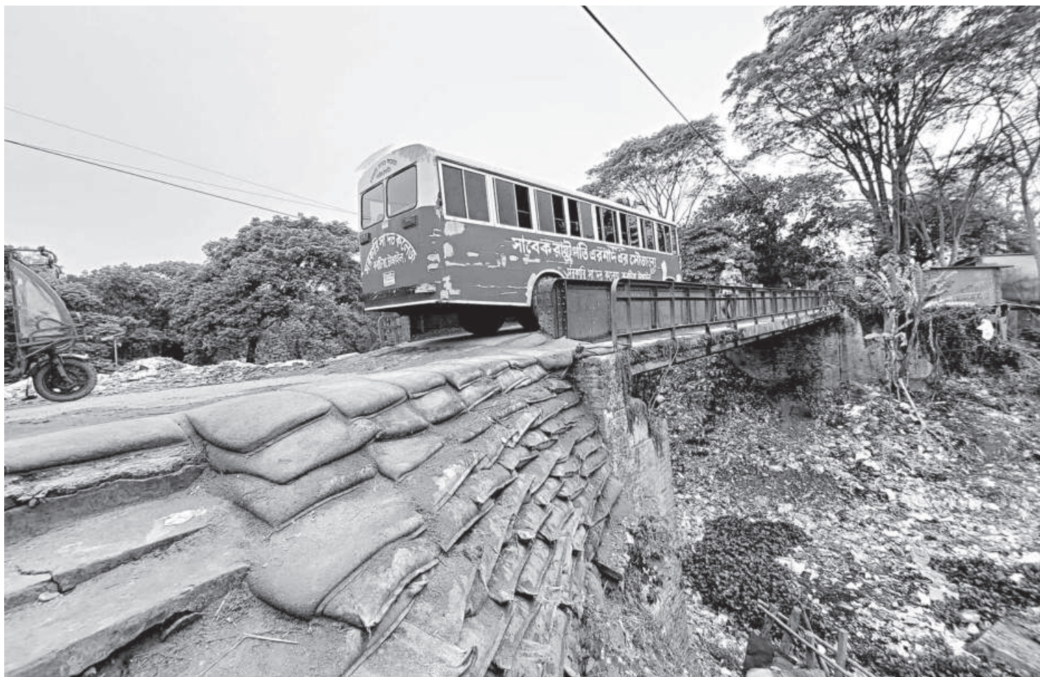
The iron bridge over a canal on the Old Dhaka-Tangail Road lies in a derelict state and could collapse at any moment, leading to a fatal accident. The bridge was constructed around 1952, but has been worn out over the years due to a lack of maintenance and the pressure of hundreds of heavy vehicles crossing it daily. The photo was taken recently.