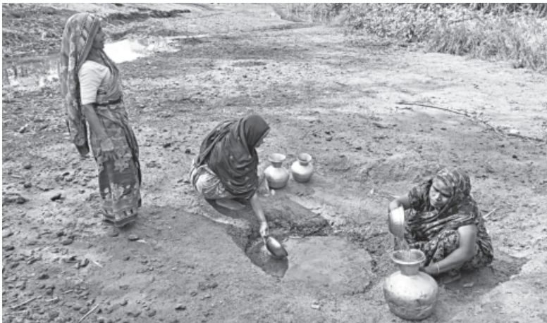
Women collect water from a dried up stream at a village in Mymensingh's Dhobaura upazila. For decades, families in 15 villages in the upazila have been experiencing some form of water crisis, but it only got worse in recent years. Now, women, who primarily collect water for their families, are forced to walk long distances and rely on such sources for safe drinking water.

More than 500 poor families, including many from the indigenous Garo community, have been hit by an acute crisis of drinking water in 15 villages under Mymensingh’s Dhobaura upazila. The crisis, which persisted for decades, only exacerbated over the recent years as there is little to no feasibility of installing tube wells or submersible pumps to draw up water in the hilly areas of the upazila along the border, said locals. On different occasions, local administration took initiatives for arranging safe drinking water for the people, but it has not been enough to mitigate the crisis, especially in the dry season, they added. “There is hardly any natural source of water in this area apart from some hilly streams which stop flowing during the dry season, making life extremely difficult for the local people,” said Md Humayun Kabir Sarker, chairman of Dakshin Maizpara Union Parishad. The groundwater table in the plain land also depletes during this time, worsening the situation, he added. Humayun Kabir said they have installed 10 deep tube-wells in the locality over the last three years, but it has not been enough.