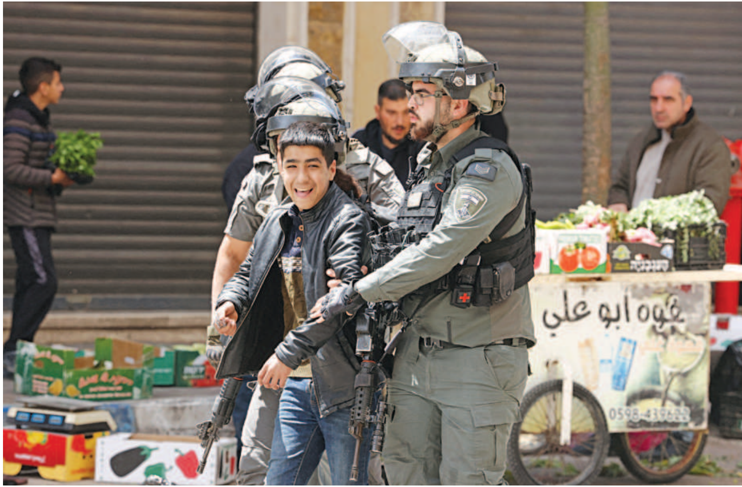
Israeli soldiers detain a Palestinian boy after he threw rocks ahead of a visit by Ultra-Orthodox Jews to the shrine of Atnaeil Ben Kinaz in the city of Hebron in the Israeli-occupied West Bank yesterday. Israel's military said it had killed two Palestinians in the West Bank, including one suspected of carrying out an attack that left Israelis dead in January.

"Many member states are facing a significant backlog of applications, so anything we can do now to support faster asylum decisions is essential," said Magnus Brunner, the EU's commissioner for migration.