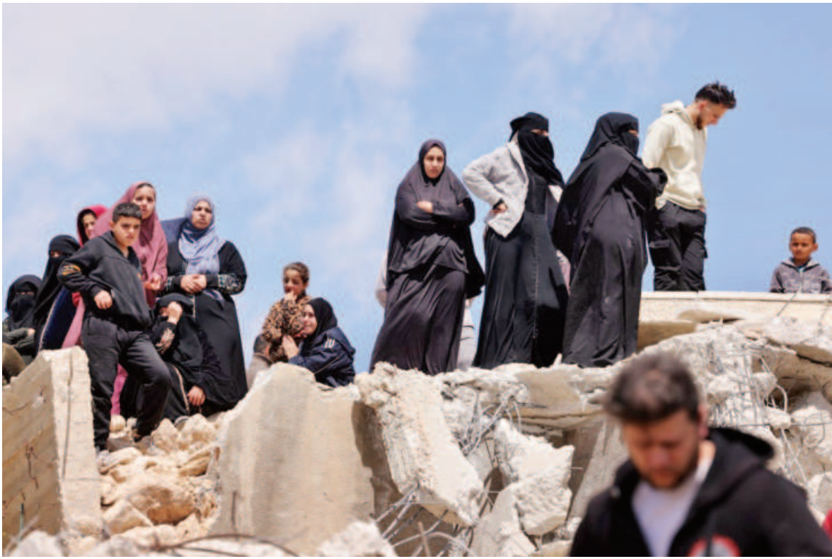
Palestinians from Al-Hirsh family stand near the ruins of their houses after they were demolished by Israeli bulldozers in the village of Al-Rihaya, south of the occupied-West Bank city of Hebron yesterday.