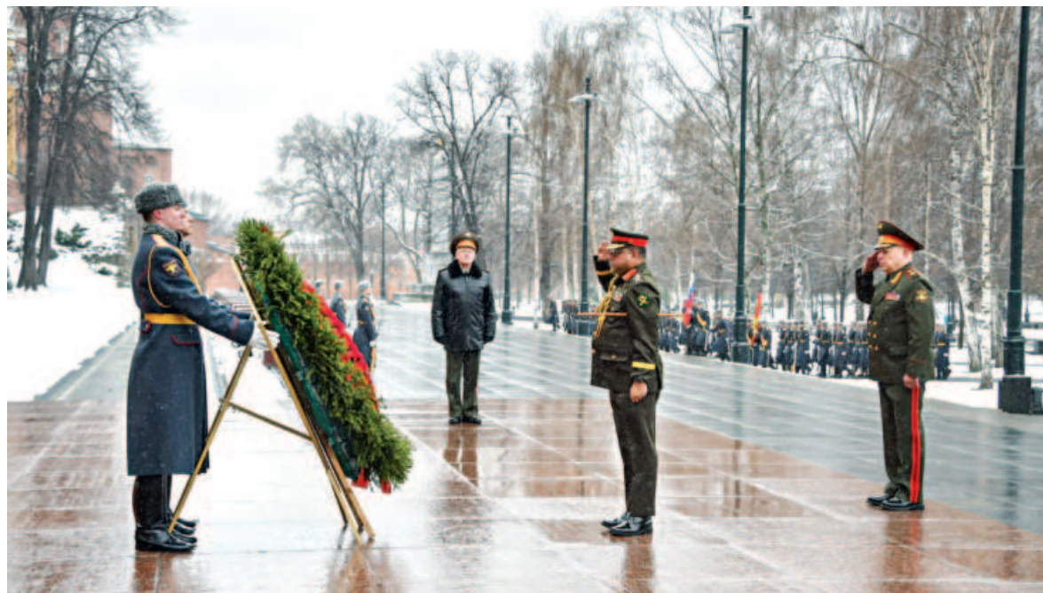
Army chief General Waker-Uz-Zaman pays tribute to the fallen Russian soldiers at the Tomb of the Unknown Soldier in the Alexander Garden, Moscow yesterday. Oleg Salyukov, commander-in-chief of the Russian Ground Forces, was present on the occasion. General Waker is in Russia on an official visit. Following his stay in Russia, Waker is scheduled to go to Croatia on April 10. The army chief is scheduled to return home on April 12, said an ISPR media release.