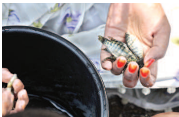
Children bathe and play in a waterbody in the Suhrawardy Udyan. Afterwards, they use a net to catch various fish that resides in the water. Inset , they managed to catch some fries as a result of their fishing efforts. The photos were taken recently.