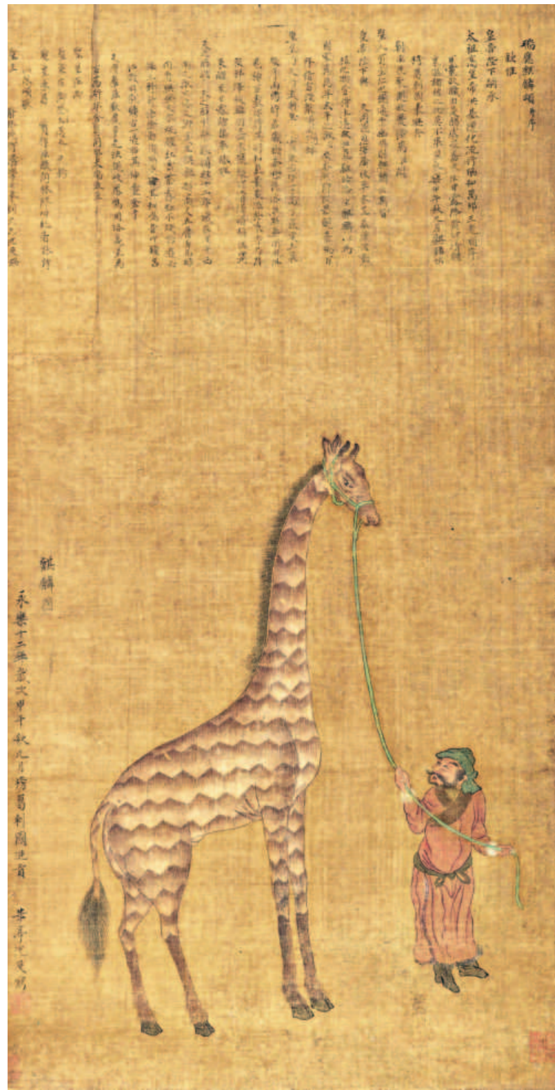
On September 20, 1414, the Sultan of Bengal sent a giraffe as tribute to the Yung-lo Emperor of China. The animal arrived at the Ming court to great acclaim and was thoroughly documented in words and images, like in this hanging scroll from the Philadelphia Museum of Art. The giraffe was interpreted at court as the qilin, a mythical beast supposedly seen only when a sage ruler was on the throne. Many exotic animals were sent as tribute to the Ming court from lands visited by the imperial fleet and its admiral Cheng Ho.