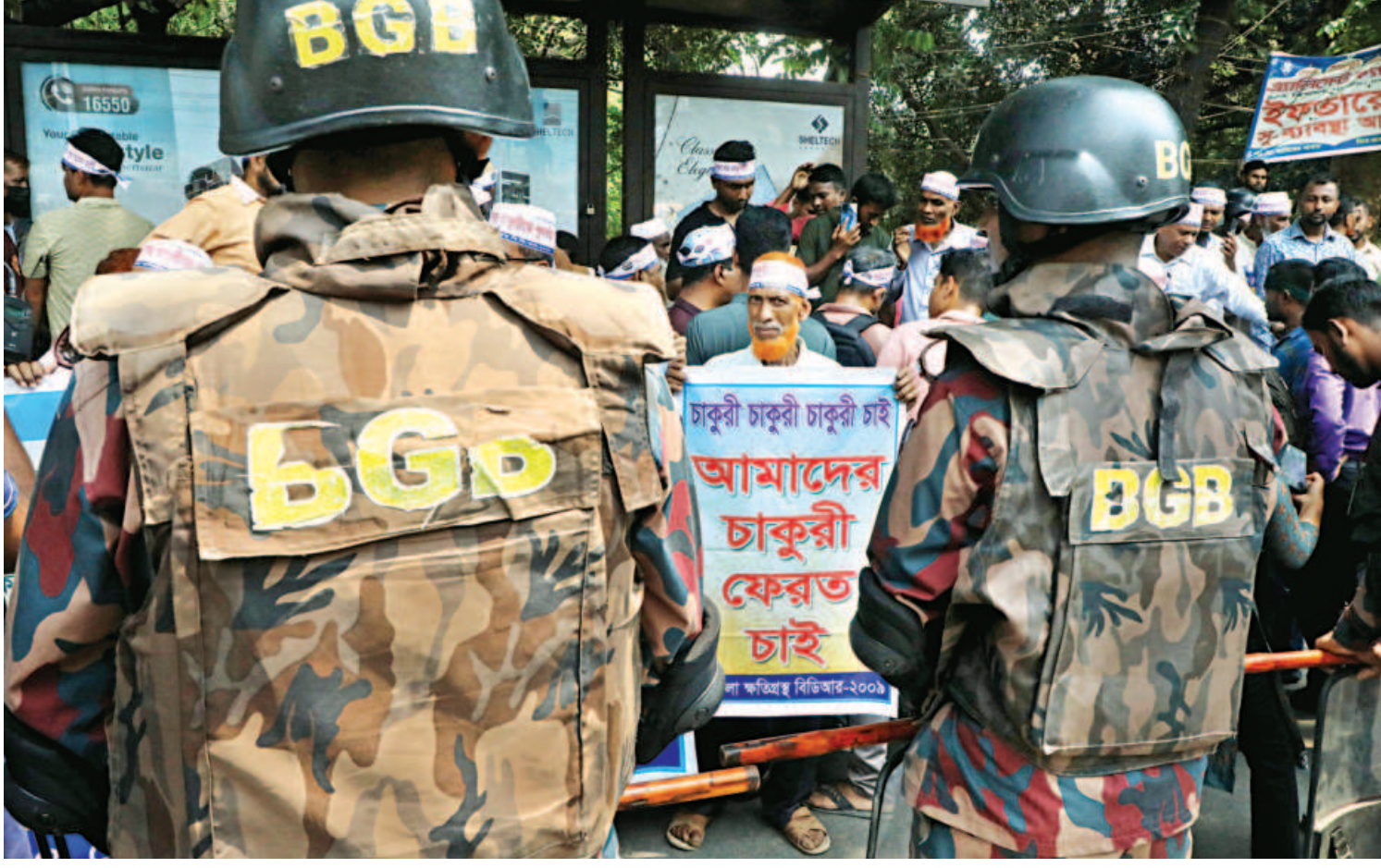
Demanding reinstatement to their jobs and compensation, dismissed members of the erstwhile Bangladesh Rifles (now Border Guard Bangladesh, or BGB) demonstrated in front of its headquarters at Pilkhana, Dhaka yesterday morning.