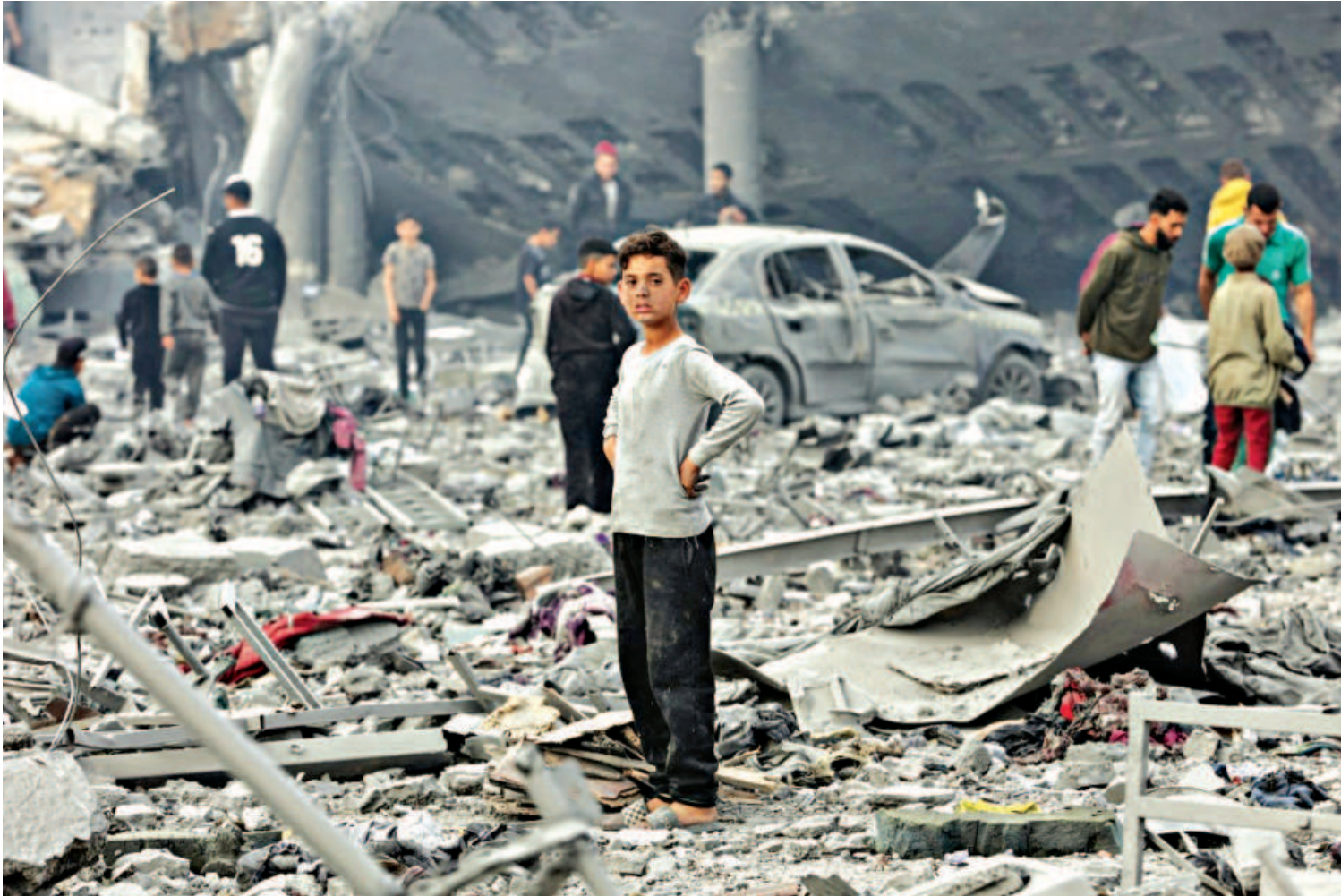
A young boy looks on as Palestinians stand amid the devastation in the yard of a school yesterday, a day after it was hit by an Israeli strike, in the al-Tuffah neighbourhood of Gaza City.