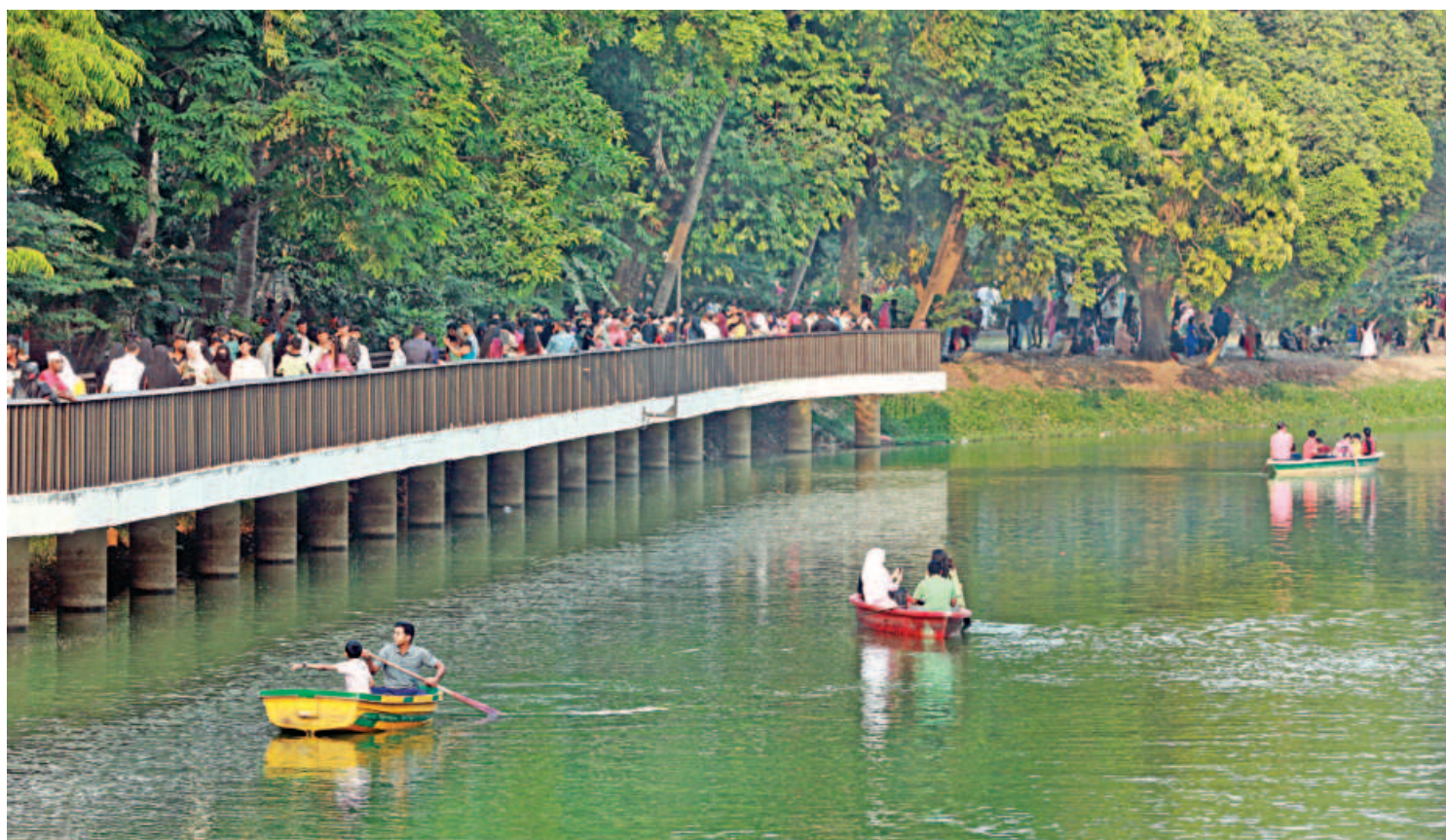
People enjoy various activities such as boating at the Ramna Park, while others look on to enjoy the sights and scenes. On the fourth day of Eid yesterday, people continued to enjoy the holidays in full swing.

A diver team of the fire service started a rescue operation around 11:30am and recovered Billal's body. Search for the other two missing farmers is ongoing.