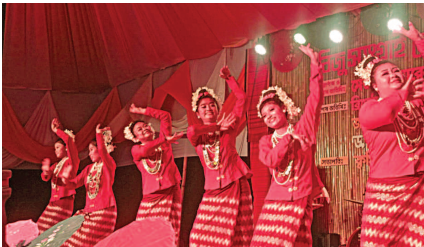
Artists performing at an event in Rangamati Cultural Institute. In anticipation of the Biju-Sangrai-Boishu-Bishu-Bihu festival, a key cultural celebration for the indigenous communities of the hill tracts, the seven-day Biju festival kicked off yesterday.