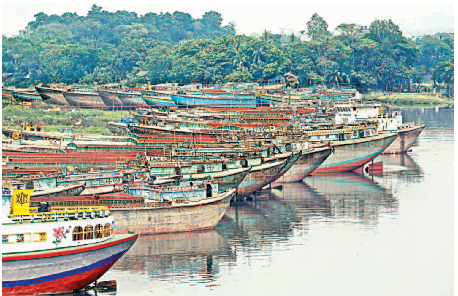
Sand-laden barges stay docked by the bank of the Shitalakshya. With the Eid holidays underway, most of the workers are yet to return to the capital. The photo was taken in Demra yesterday.