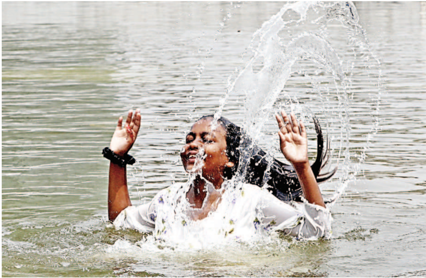
A young girl takes a dip in a waterbody inside Suhrawardy Udyan, trying to cool off amid the ongoing heat wave. According to the meteorological office, soaring temperatures could continue throughout this month with the possibility of reaching the level of a severe heat wave. The photo was taken yesterday.