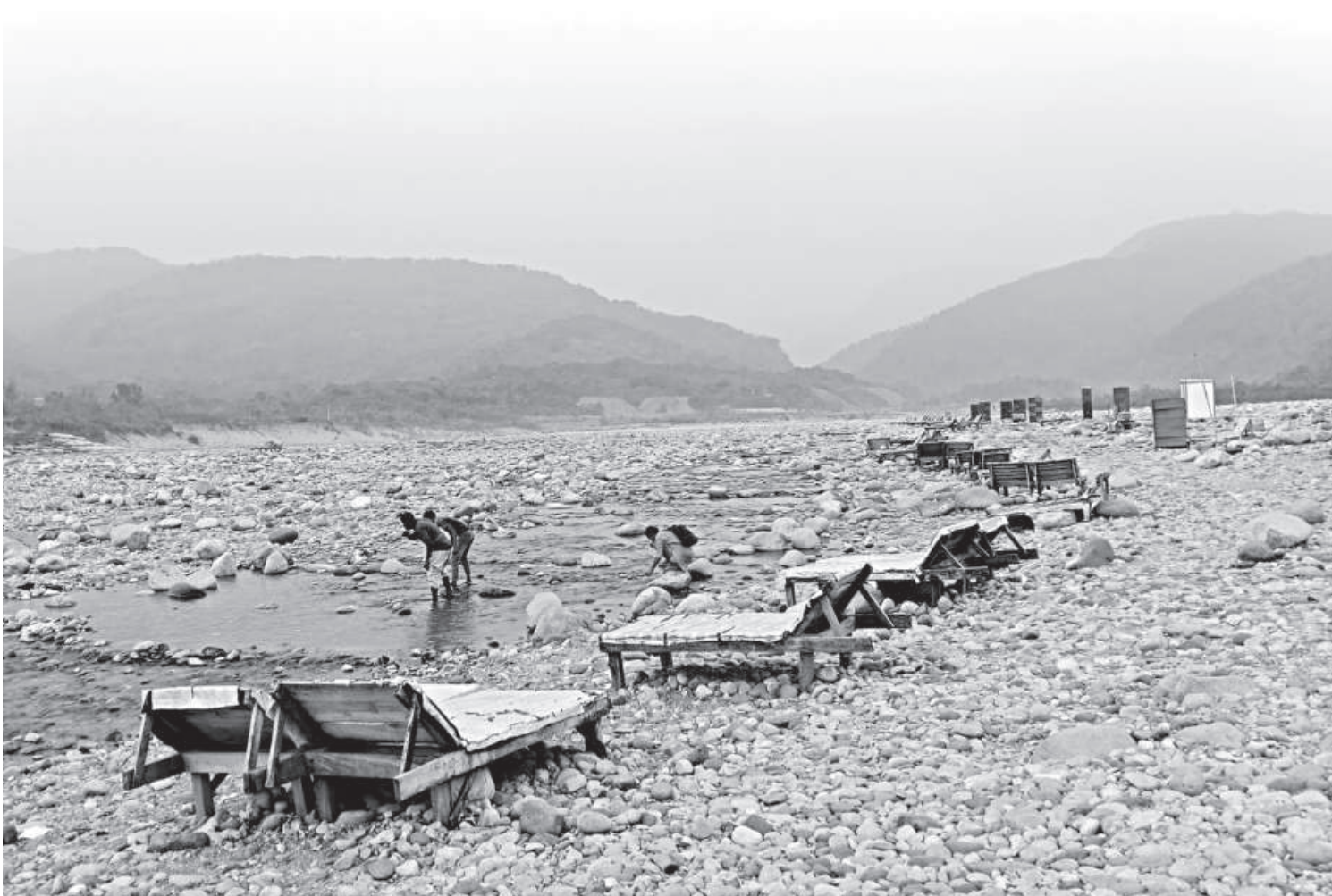
Sylhet's renowned Bholaganj Sadapathar tourist spot now stands deserted as tourist numbers dwindle during Ramadan. Traders, hoping for a post-Eid surge, eagerly await the holiday season to revive their businesses. The photo was taken recently.