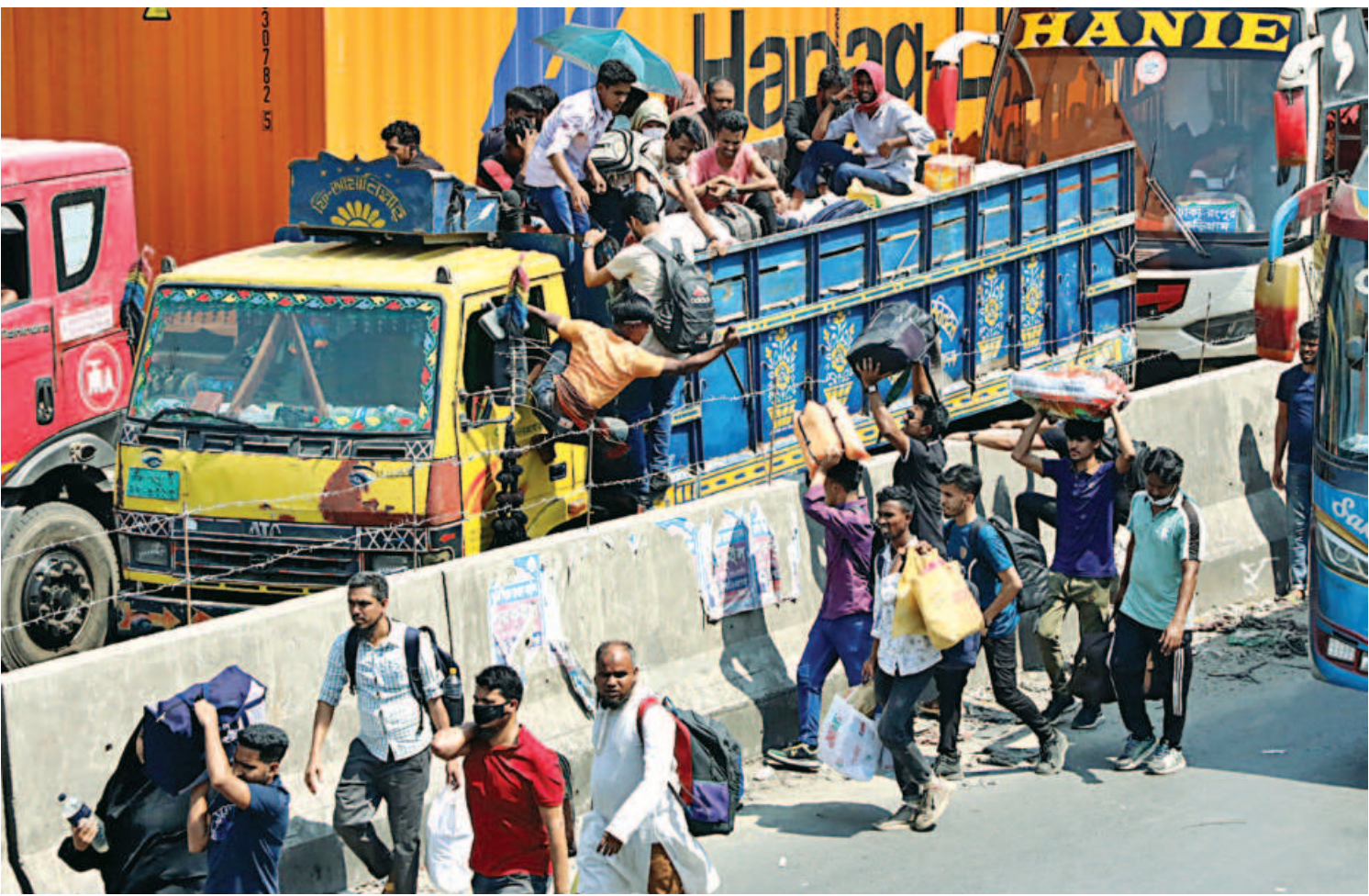
A severe gridlock on the Dhaka-Tangail Highway at the Chandra intersection in Gazipur disrupts the journey of thousands leaving Dhaka to celebrate Eid with their loved ones. With overcrowded buses and scarce tickets, many are forced to walk to their destinations, while others risk climbing onto trucks for a ride home. The photo was taken yesterday.