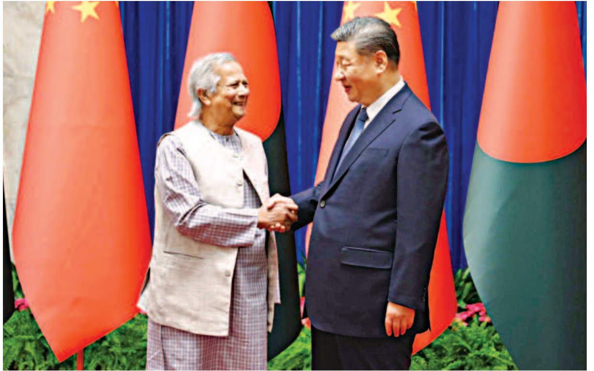
Chief Adviser Prof Muhammad Yunus meets Chinese President Xi Jinping at the Great Hall of the People in Beijing yesterday -- the third day of his four-day visit to China.