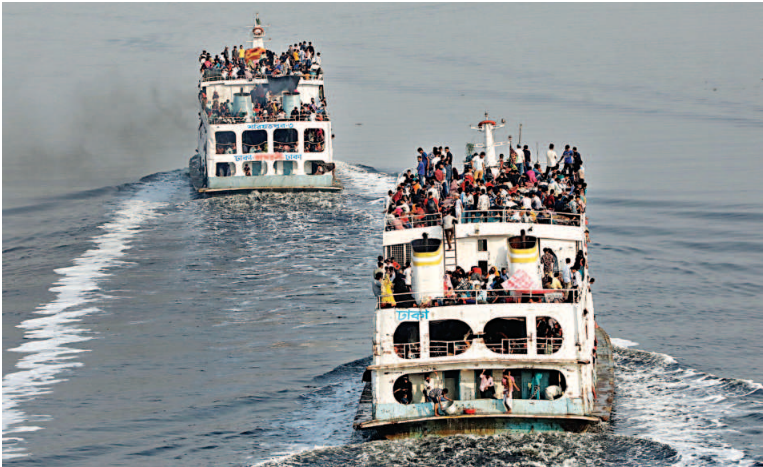
Hundreds of people travelling to their village homes crowd onto launches, filling every inch of available space, including the roof, as the nine-day Eid vacation began yesterday. The photo was taken from Postogola Bridge in Dhaka.