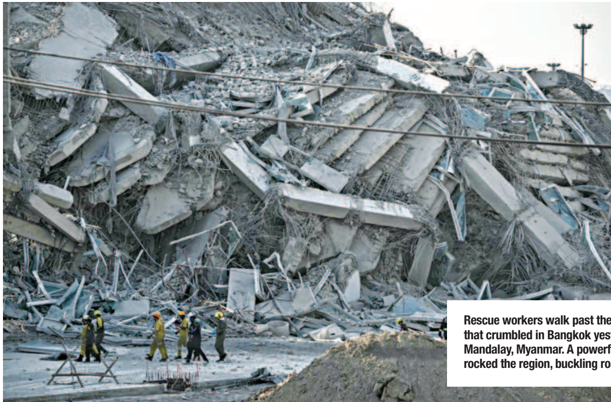
Rescue workers walk past the debris of an under-construction building that crumbled in Bangkok yesterday. Bottom left, a collapsed building in Mandalay, Myanmar. A powerful earthquake, originating in central Myanmar, rocked the region, buckling roads, and destroying buildings.