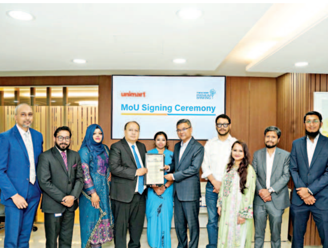
Officials of BRAC Bank and Unimart pose with the signed document at the bank's head office in the capital recently.