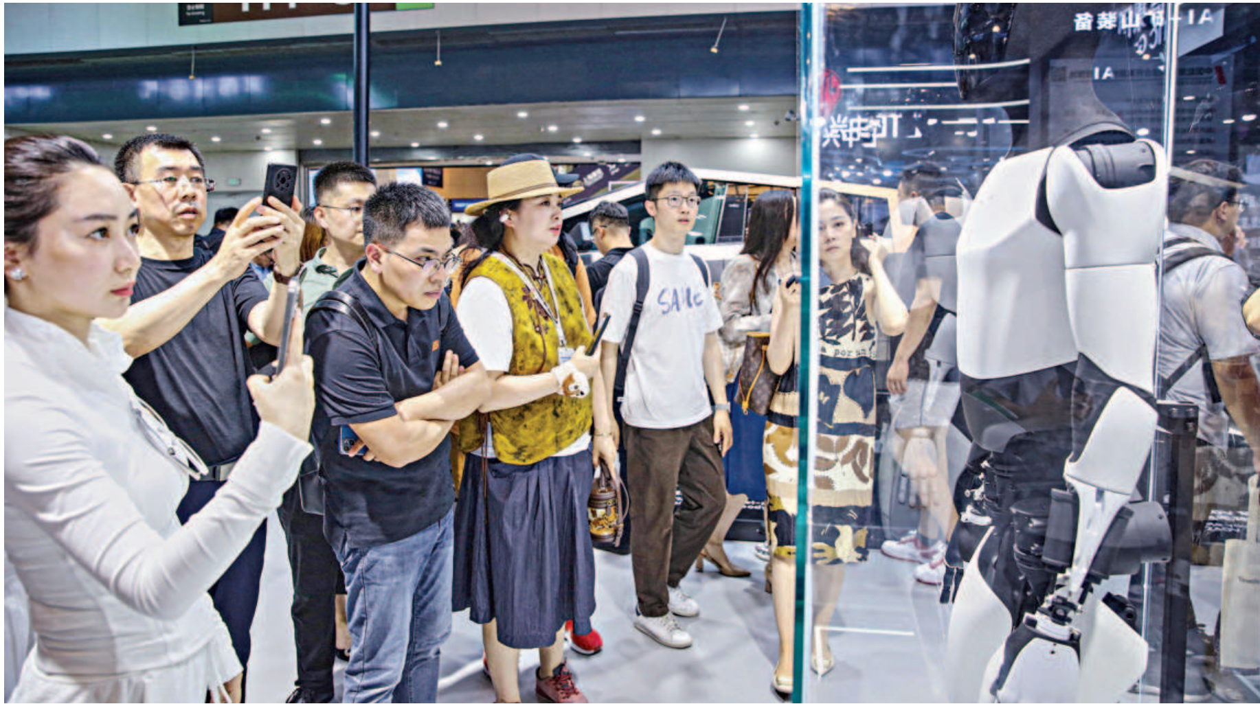
Visitors look at Tesla's humanoid robot Optimus at its exhibition booth during the World Artificial Intelligence Conference in Shanghai.