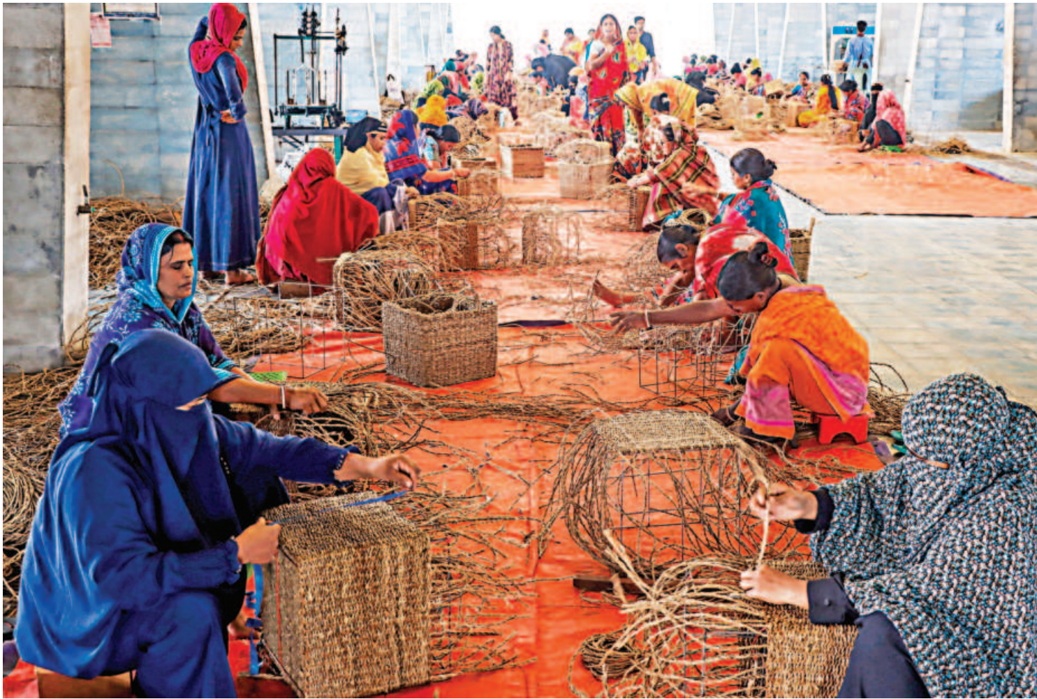
Women weave elephant grass, or hogla pata as is called in Bangla, in intricate patterns to create baskets and other household items at Dumuria Village Super Market in Khulna. The work is undertaken on completion of household chores and provides some income for the women. A private company manages the production and sells the products abroad. The photo was taken recently.

"Here we have simplified the organisation and become faster at adapting to new trends and creating a more relevant assortment."