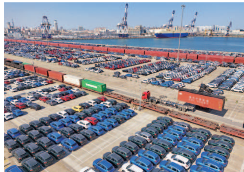
Cars for export are seen at a port in Yantai, China's eastern province of Shandong.

The Center for Automotive Research has previously estimated that US tariffs — including those on imported autos and metals — could increase the price of a car by