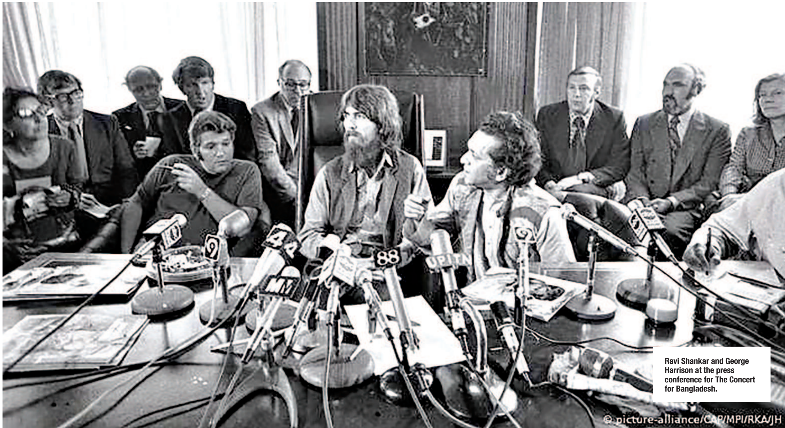
Ravi Shankar and George Harrison at the press conference for The Concert for Bangladesh.