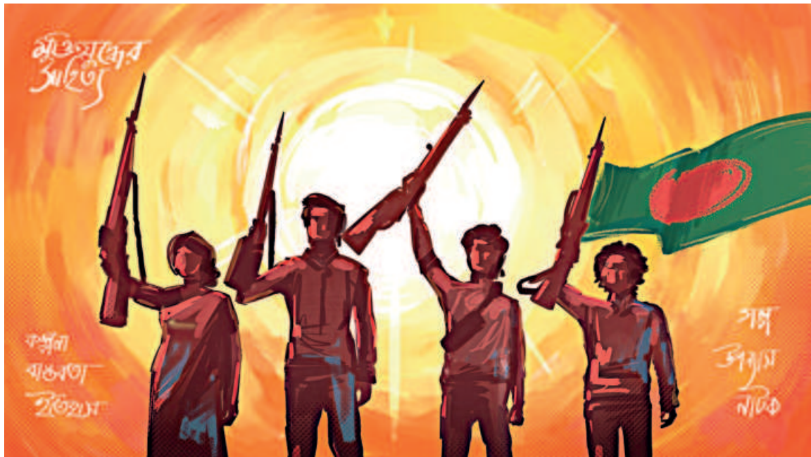
ILLUSTRATION: REHNUMA PROSHOON

Many freedom fighters and literary figures believe that skilled writers, adept at crafting literary works, often lacked direct experience of the 1971 War.