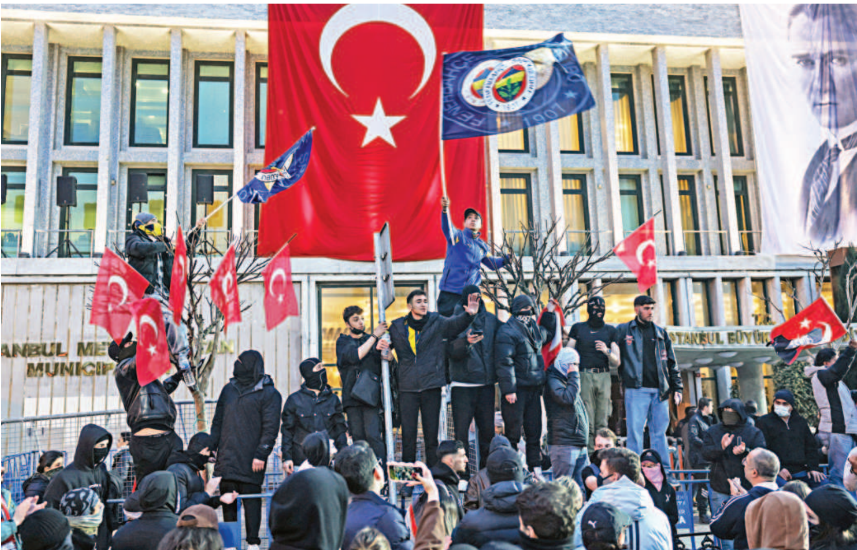
People protest the arrest of Istanbul Mayor Ekrem Imamoglu as part of a corruption investigation, in Istanbul, Turkey, yesterday. Story on Page 7.