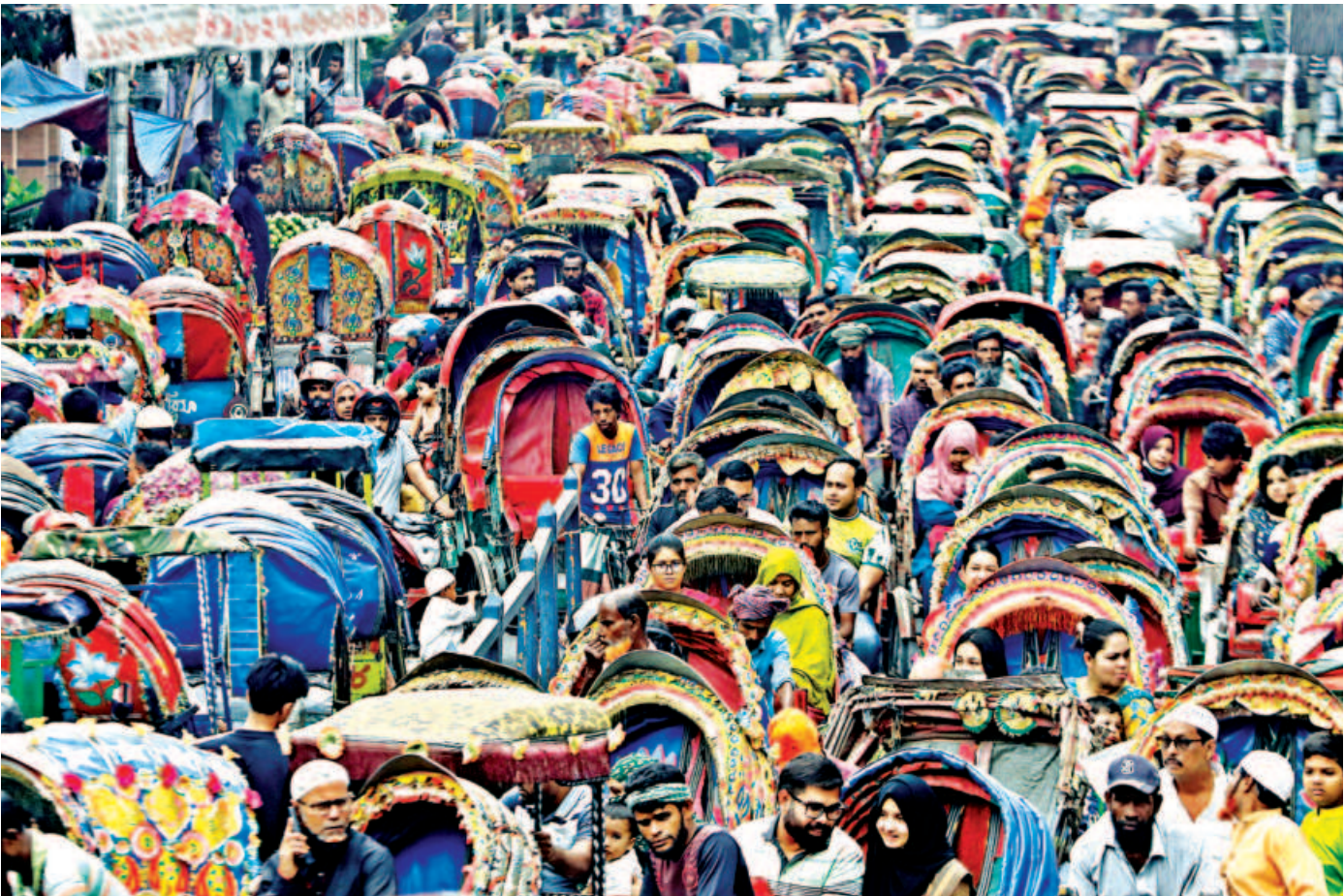
Hundreds of rickshaws stuck in a jam on Dhanmondi Road-1 around 11:30am yesterday. This street sees a surge in the number of rickshaws during Ramadan due to the increase of seasonal pullers. However, battery-operated rickshaws are more visible this year.