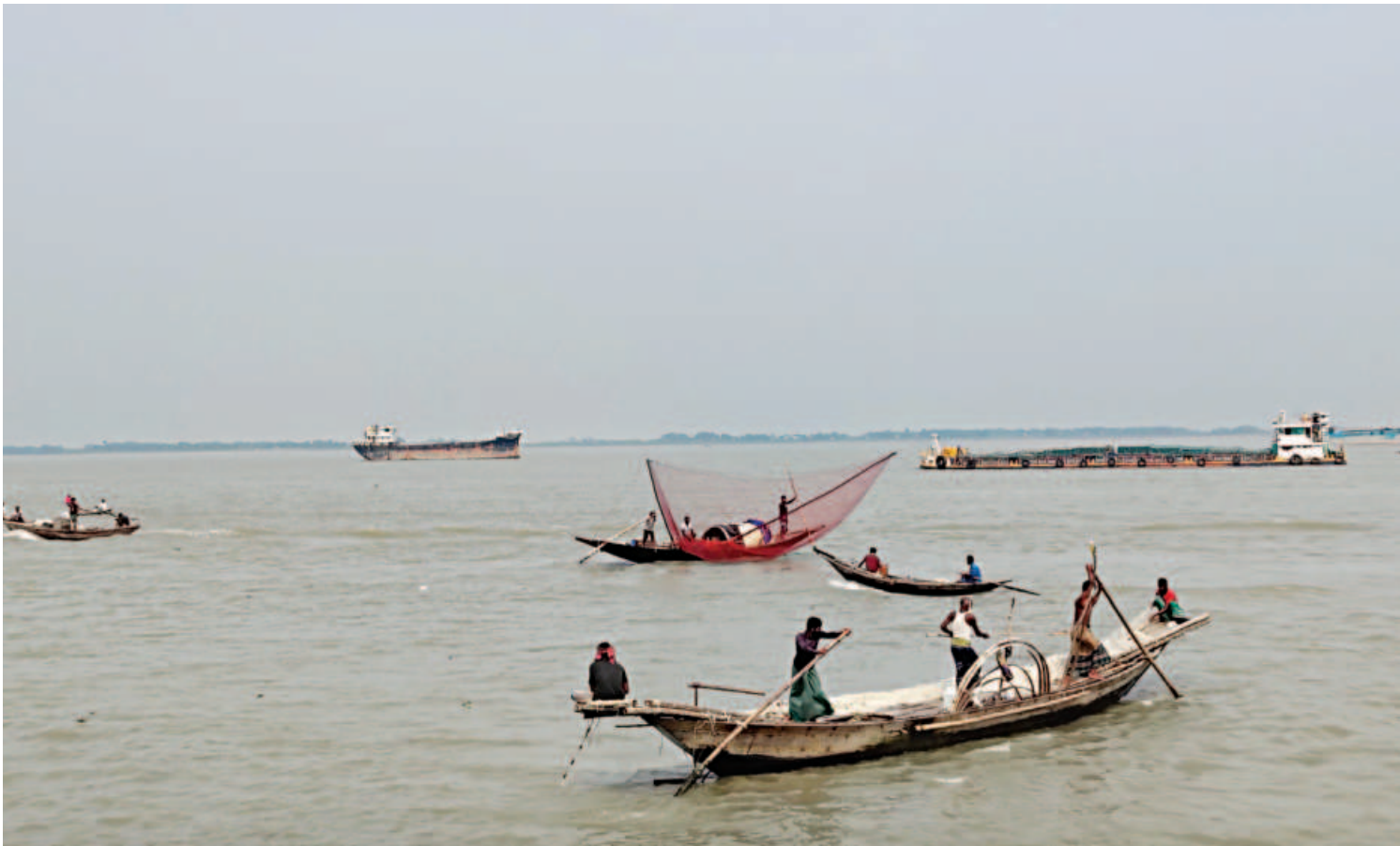
Fishermen catching jatka (hilsa fry) using nets at Tulatoli point in the Meghna sanctuary in Bhola Sadar upazila although a two-month ban on fishing, which began from March 1, is on. The ban is imposed to increase the production of hilsa. Those who violate the ban can be sentenced to a maximum of two years imprisonment and fined Tk 5,000. The photo was taken on Saturday.