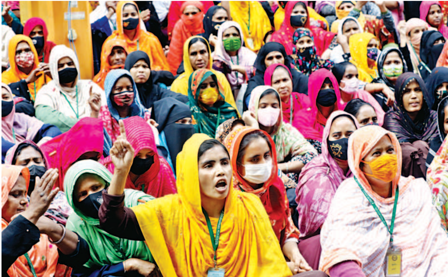
Workers of Apparel Plus Eco Ltd in Gazipur demonstrating in front of Labour Bhaban in the capital’s Bijaynagar yesterday, demanding payment of three-month arrears and Eid bonus.

AFP, Tehran Iran’s Revolutionary Guards have unveiled new missile systems on three strategic islands in the Gulf, saying they can target nearby “enemy bases, vessels, and assets”, state media reported Saturday. The weapons were deployed on Greater Tunb, Lesser Tunb, and Abu Musa near the Strait of Hormuz, a globally vital shipping lane. The Guards recently held military manoeuvres in the area. Saturday’s announcement comes with Iran poised to respond to a letter from US President Donald Trump urging a resumption of nuclear talks and warning of possible military action if Iran refuses. “We have a tactic that we must arm” the island group “and make it operative”, said Alireza Tangsiri, naval commander of the Islamic Revolutionary Guard Corps, the ideological branch of Iran’s military. “We are capable of attacking enemy bases, vessels, and assets in the region,” he told state television. The new systems “can completely destroy any target within 600 kilometres (370 miles)”. On Friday, supreme leader Ayatollah Ali Khamenei said US threats against Iran “will get them nowhere”, and warned that “if they do anything malign to the Iranian nation, they will get a hard slap”. On Thursday, Foreign Minister Abbas Araghchi SEE PAGE 6 COL 6