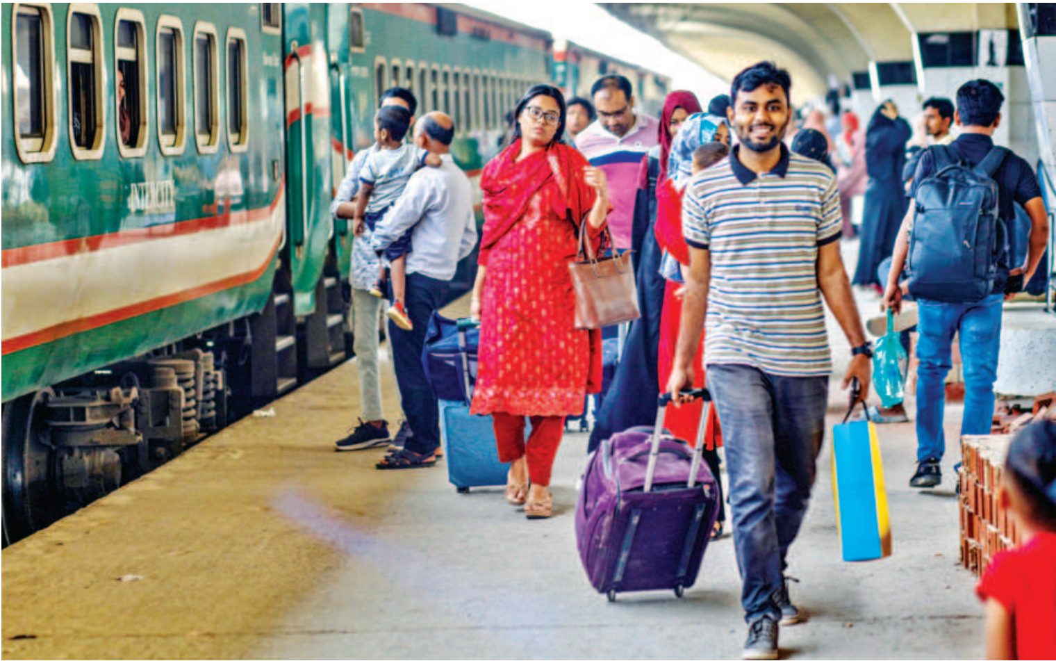
Kamalapur Railway Station is teeming with people leaving Dhaka for their village homes yesterday. A lot of people leave early to avoid the Eid rush. This Eid holidays effectively start on March 26 for many.