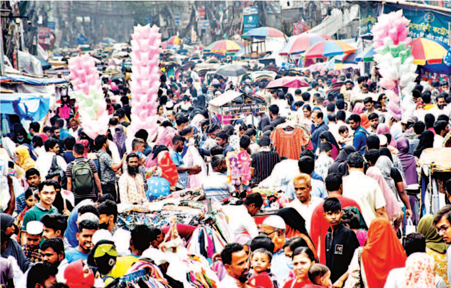
As Eid approaches, people are hurrying to complete the shopping for their families and friends. The photo was taken near the capital's Gausia Market yesterday where the entire street is full of shoppers and hawkers.