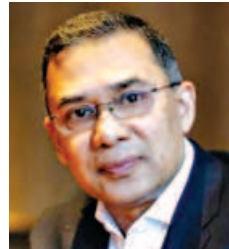
SEE PAGE 6 COL 5

The BNP acting chief said both the party and the nation expect a fair and neutral