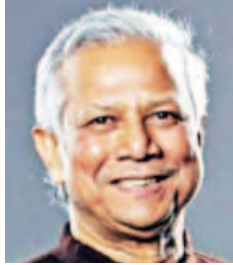
SEE PAGE 6 COL 1

He said that Prof Yunus will address the Boao Forum for Asia conference, called the "Davos of the East", on March 27 with the focus on the changing role of Asia in