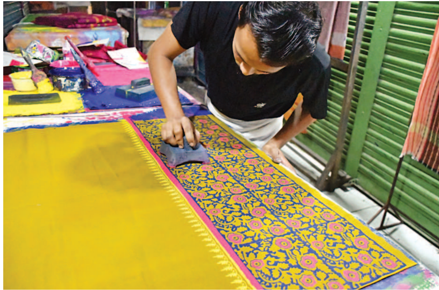
A craftsman meticulously applies block printing patterns on fabric. Boutique artisans throughout the capital are working diligently, anticipating a surge in demand before Eid-ul-Fitr. The photo was taken recently in Dhaka's New Market area.