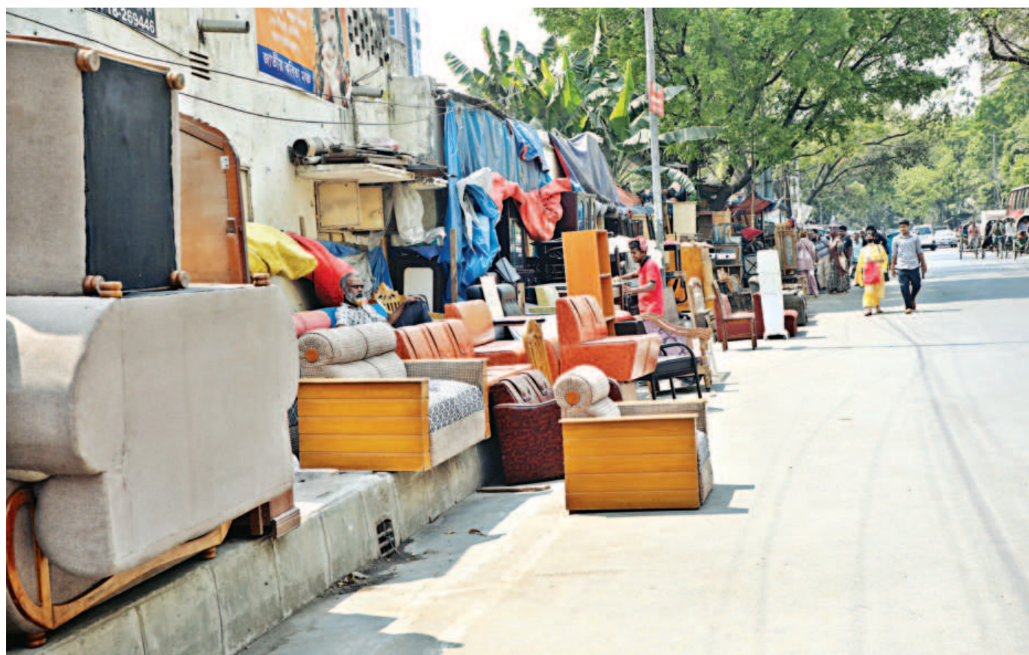
Illegal businesses selling refurbished second-hand furniture occupy pavements and spill over onto the street, causing inconvenience to pedestrians. The photo was taken yesterday near the Shilpakala Academy in the capital's Segunbagicha.