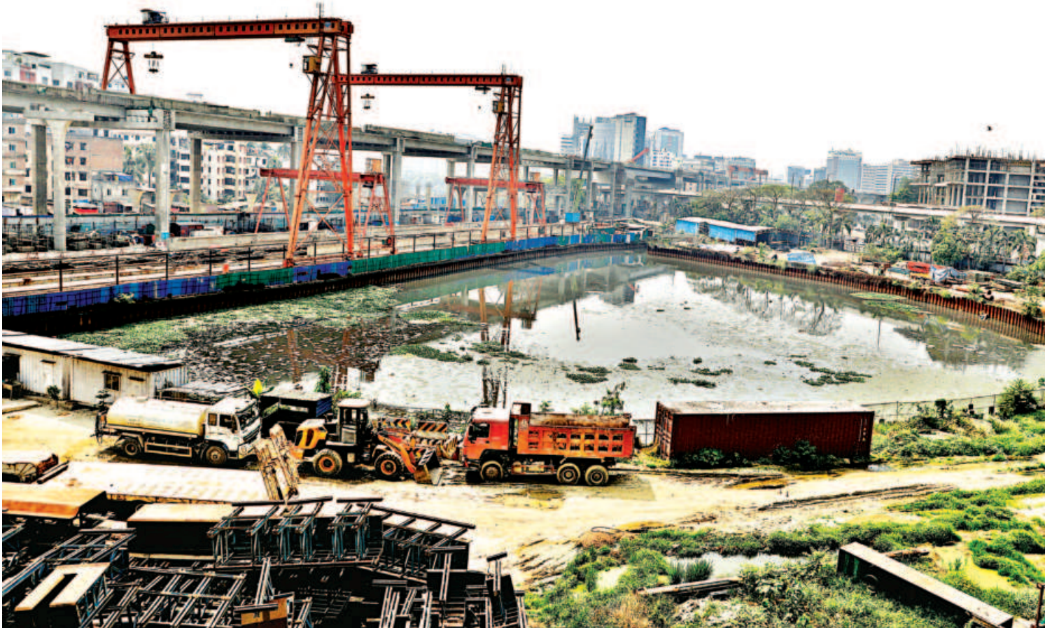
Since January last year, the Dhaka Elevated Expressway project has been plagued by slow progress and work stoppages. The setbacks stem from various issues, such as ownership disputes among the private partners and protests by environmentalists against the construction of a ramp at Panthakunja Park. The photo was taken yesterday near the capital's Hatirjheel area.