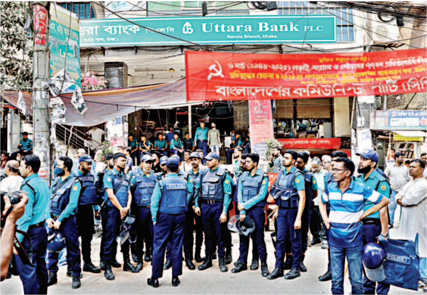
Policemen stand guard outside the Communist Party of Bangladesh office on Topkhana Road in the capital yesterday as security measures were heightened in response to calls online to take over the party office.