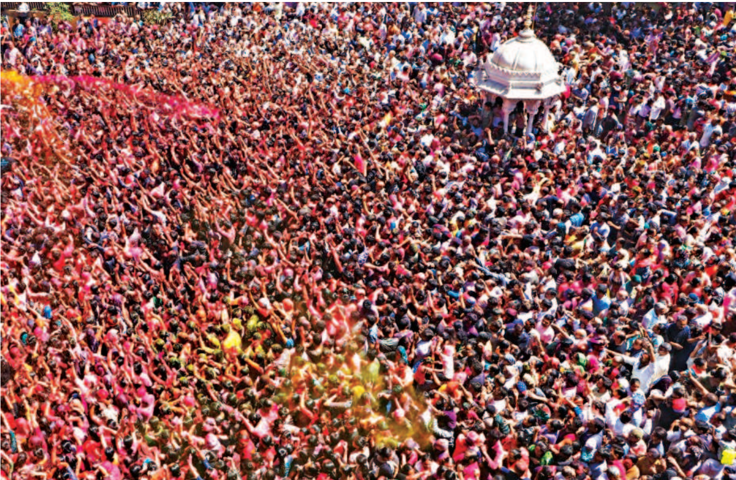
Revellers smeared with gulal (colour powder) to celebrate Holi, the Hindu spring festival of colours, at a temple in India's Ahmedabad yesterday.

Mark Carney was sworn in as Canada's prime minister yesterday, taking charge of a country rattled by a breakdown in US relations since President Donald Trump's return to power. The ruling Liberal Party overwhelmingly backed Carney to replace Justin Trudeau, betting his experience leading two central banks through historic crises will reassure Canadians facing a potentially devastating trade war. Carney, who turns 60 on Sunday, is a political novice who has never won an elected public office but his campaign skills will be tested soon with Canada likely headed for a general election in weeks. The threats posed by Trump are expected to dominate the vote. The US president has sought to bludgeon Canada, imposing sweeping import tariffs and threatening further levies while claiming the country is not "viable" on its own and should be annexed by Washington. Carney, who was sworn in as Canada's 24th prime minister at a ceremony in Ottawa, has described Trump's stance as the most serious challenge Canada has faced in a generation. He was an investment banker at Goldman Sachs before serving as governor of the Bank of Canada during the 2008-2009 financial crisis.